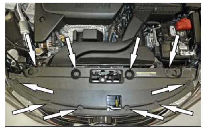
3. Remove the eight plastic clips securing radiator cover by lifting center of clip. After removing all clips lift cover off. Save for a later step