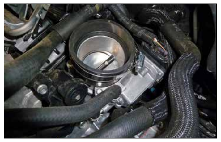
8. Install the Spectre<sup>®</sup> reducer coupler onto throttle housing and secure with provided clamp.

7. Release spring clamp and remove PCV hose from valve cover, then loosen hose clamp on intake boot and remove boot.