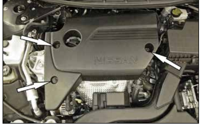
2. Remove the three bolts securing engine cover and remove cover.

NOTE: This kit was designed and tested on a stock engine without any custom tuning done to the engine computer. Removing the battery cable may erase the programmed radio stations. The anti-theft code will need to be entered into some radios after the battery cable is connected. The anti-theft code can typically be found in the owner's manual or at your local dealership.