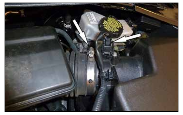
5. Disconnect MAF sensor connector by raising safety tab and push down. Release harness clips from air box. Loosen air boot hose clamp.