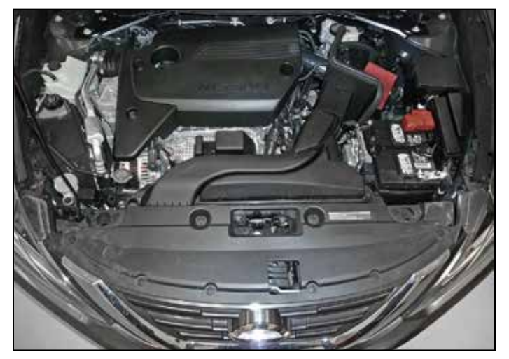
16. Install radiator cover removed in step 3.

17. Make sure that all clamps and hardware are fully tightened. Reconnect the battery cable, start the vehicle and let it warm up. Shut off and inspect the installation once more for any loose clamps, wires, or hardware. Test drive & enjoy! Your installation is now complete. Periodically check all clamps and brackets.