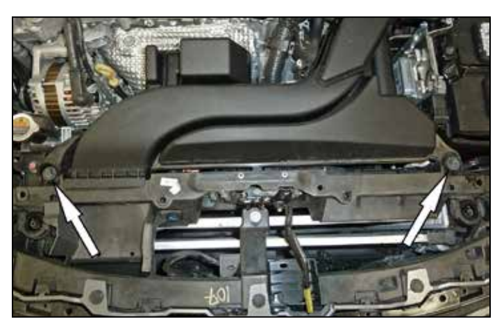
4. Remove the two bolts securing air intake duct and remove duct. This will be reinstalled in a later step.