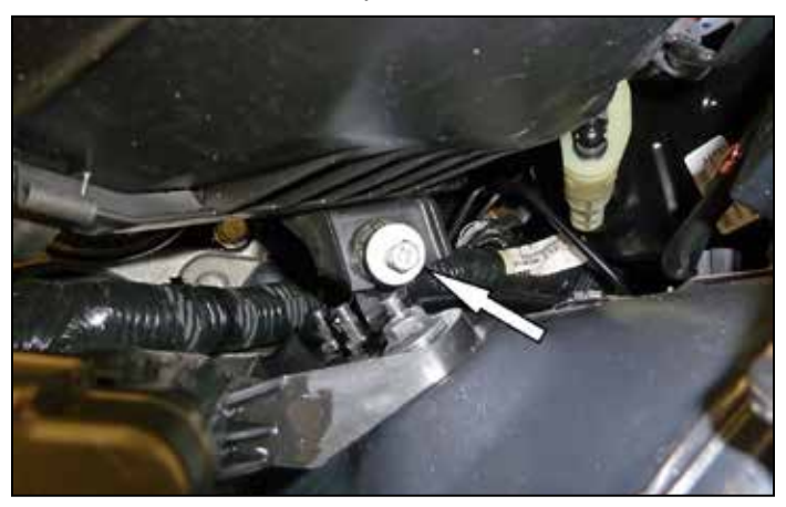
6. Remove bolt on right side of air box then remove air box from vehicle.