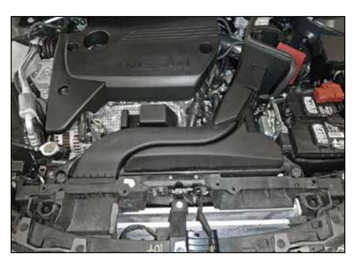
15. Install air intake duct removed in step 4.