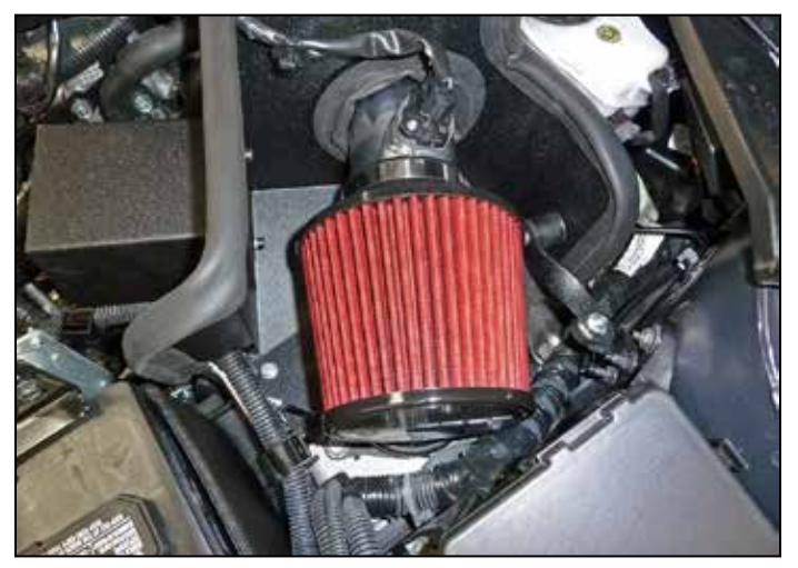
14. Place the Spectre<sup>®</sup> high flow air cleaner onto intake tube making sure calibration sleeve is located properly and tighten clamp.

13. Install PCV hose onto intake tube and valve cover, secure with provided clamps.