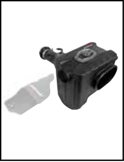
Momentum GT Air Intake

P/N: 50-70034D (Pro DRY S) 50-70034R (Pro 5R)