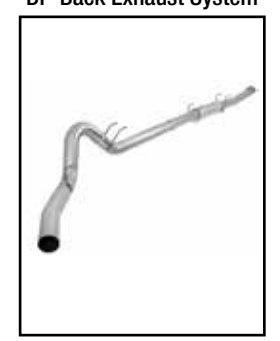
P/N: 49-03039 (w/ Muffler) 49-03039NM (No Muffler)