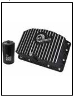
P/N: 46-70322 (Blk./Mach.) 46-70320 (RAW)