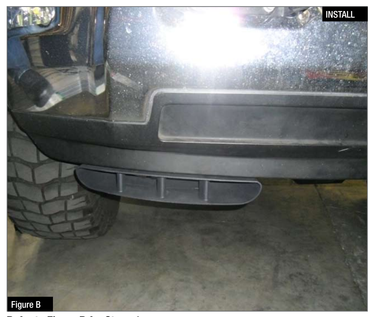
Refer to Figure B for Steps 4