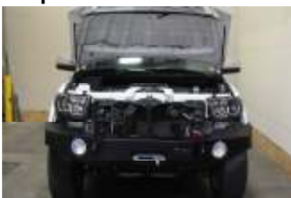
Install the Anzo Headlights by reversing the steps 2 to 5