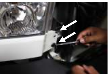
Locate the two trim pins on the lower headlight trim panel and remove the two pins