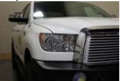
Tools needed: 10mm Socket Trim Pin Remover