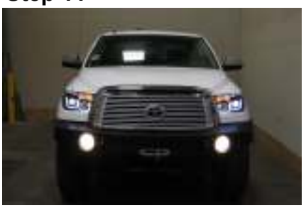
Test all functions before operating the vehicle

AnzoUSA<sup>™</sup> products are covered, by a limited one (1) year warranty, to be free of manufacturer's defects. However, certain AnzoUSA<sup>™</sup> product categories have warranty policies which differ from this standard, please contact your representative for detailed category information. Damage due to improper installation or road hazards is not covered. Seller and manufacturers' only obligations shall be to replace the product proven to be defective. Neither seller nor manufacturer shall be liable for any injury, loss or damage, direct or consequential, arising out of the use of or the inability to use the product. Before using, user shall determine the suitability of the product for its intended use, and user assumes all risk and liability whatsoever in connection therewith.