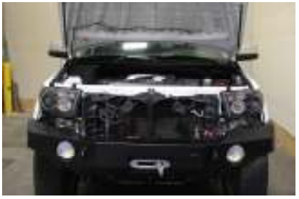
Remove the headlights