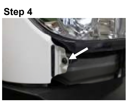
Remove the 10mm screw located at the bottom of the headlight housing