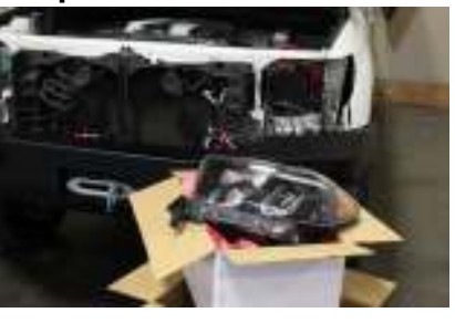
Remove the Anzo headlights out of its box

Installation Manual: Part Number: 111293, 111294