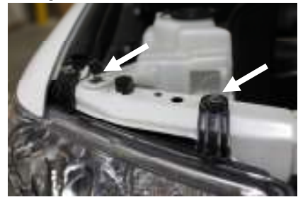
Remove the two 10mm screws located at the top of the headlight housing