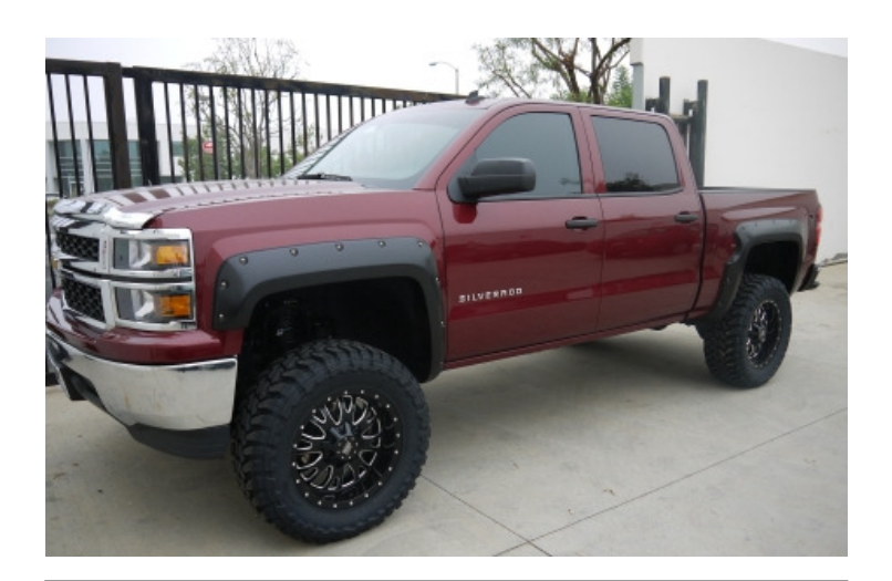
STEP 9: Ensure all fixing points are tight and secure and that the rubber seal is flush neatly against the vehicle body.

For Technical Support/Warranty Information please call 800-757-7075