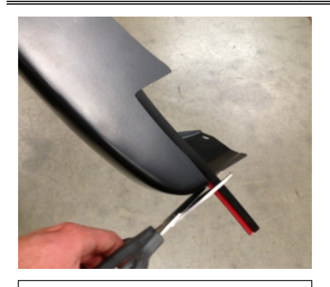
STEP 3: Attach rubber seal to the bottom front corner of Fender Flares. Peel back 1" of the adhesive backing and position on the Fender Flare. Attach the seal to the Fender Flare, ensure pressure is used to secure rubber seal to Fender Flare edge. Trim excess rubber seal and discard.