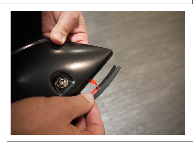
STEP 2: Attach the included rubber seal to the Fender Flares. Peel back 2" of the adhesive backing and position on the Fender Flare. Attach the seal to the Fender Flare, peeling back a few inches at a time. Ensure pressure is used to secure rubber seal to Fender Flare edge. Attach rubber seal along all areas the Fender Flare will make contact with the vehicle body. Trim excess rubber seal.

For Technical Support/Warranty Information please call 800-757-7075