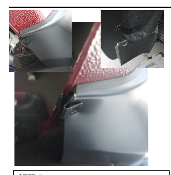
STEP 7: Slide the top edge of rear front mudguard cut out behind the factory mudguard. Install the E shape clip so that the clip slides over the inner sheet metal lip and is in line with the slot in the underside of Fender Flare. To secure the clip to Fender Flare apply inward tension on Fender Flare to the vehicle fender when installing the E clip, position the clip so that the barb in the clip locates in the slot of the Fender Flare.