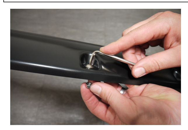
STEP 1: Attach the 11 bolts and nuts to each Fender Flare using a 3/16" Allen key and a 1/2" wrench/socket. wrench/socket. (wrench /socket and Allen key not supplied). Ensure inside of Fender Flares where the rubber seal is attached is clean, using the alcohol wipes provided. Wipe away any residue with a dry clean cloth.

PAINTING INSTRUCTIONS – If Fender Flares are being painted; do not install edge extrusion until painting is complete. Prior to painting, clean all surfaces to be painted using clean water and a mild detergent, do not use lacquer thinner or any solvent based products. Wipe completely dry. Best results will be achieved by wiping the areas to be painted with a tack rag just prior to painting. Most automotive paints can be applied directly to the Fender Flares, however some may require a primer (check paint manufacturer specifications). Good adhesion will be achieved without sanding. Select a paint (and primer if necessary) that is suitable for rigid plastics PMMA (Acrylic). If using a paint system that requires baking, do not expose the product to temperatures above 70°C (158°F). Do not fit the extrusion or any of the hardware to the Fender Flares until the paint is completely dry.