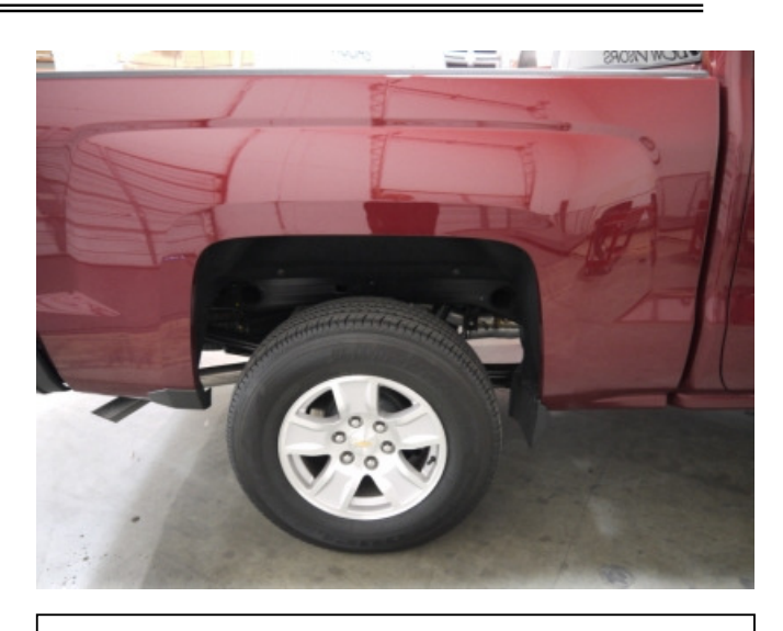
STEP 4: Clean the body areas where the Fender Flares will make contact. Ensure fenders are dry prior to install.