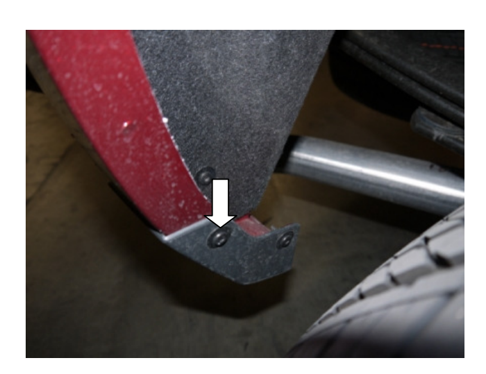
STEP 5: Using #15 Torx head screwdriver remove upper screw from the rear factory mudguard. Maintain screws for re-install.