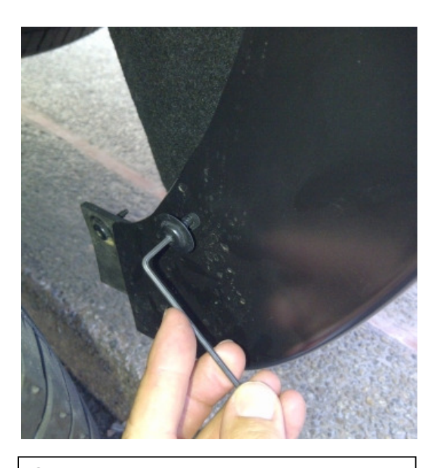
STEP 8: Using #15 Torx head screwdriver reinstall the upper screw from the rear factory mudguard through the slot in the Fender Flare.