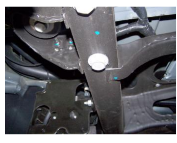
7. Install rear tailpipe hanger #I. Remove hitch bolt as seen in picture. Insert rubber grommet on hanger.

6. Install tailpipe #D into muffler 1.5-2" and secure with clamp #H. Do not tighten. Insert welded hanger into rubber grommet.