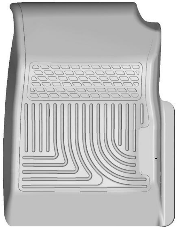
RIGHT OR PASSENGER'S SIDE

TO EASE INSTALLATION OF YOUR COLORADO / CANYON FRONT LINERS, MOVE BOTH FRONT SEATS TO THEIR MOST REARWARD POSITION. ONCE YOU HAVE INSTALLED YOUR LINERS, REPOSITION THE SEATS AS DESIRED. TAKE CARE THAT DRIVER'S SIDE LINER IS ATTACHED TO THE FACTORY FLOOR MAT POSTS.