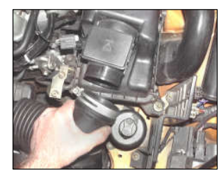
Fig. # 3