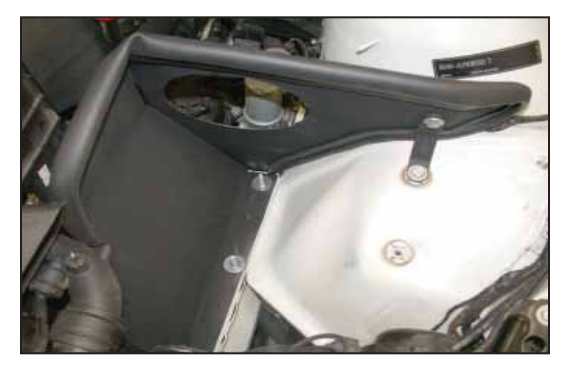
13. Secure the heat shield to the vehicle with the provided hardware. Secure bracket (010090) to the heat shield and inner fender.

NOTE: Use bolt that was removed in step 5 to secure the bracket to the inner fender.