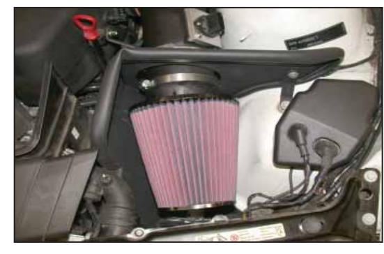
24. Install the K&N® air filter onto the K&N® intake tube and secure with the provided hose clamp.