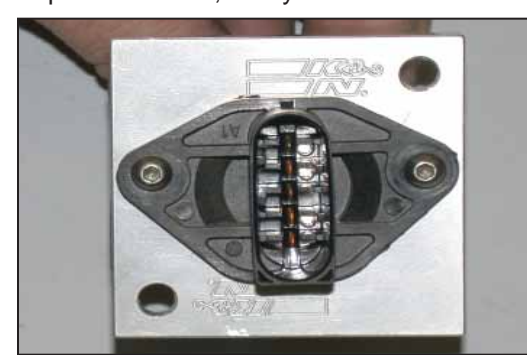
18. Install the mass air sensor into the mass air adapter as shown, secure with the provided hardware.