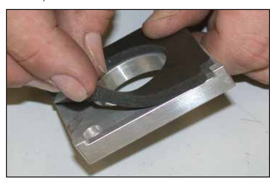
17. Install the provided gasket onto the mass air adapter as shown, sticky side down.