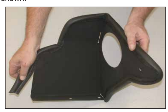
11. Install the edge trim onto the heat shield as shown.