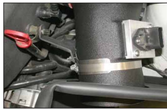
23. Attach the saddle bracket assembly to the intake plenum with the nut removed in step 9, then attach the saddle bracket to the intake tube with the provided hose clamp.