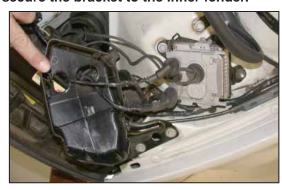
14. Re-install the head light module with the original hardware that was removed in step 5. NOTE: Install provided spacer under front mount as shown, then re-install module cover.

NOTE: Use bolt that was removed in step 5 to secure the bracket to the inner fender.