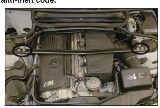
2. Remove the four 13mm nuts that secure the strut tower brace to the vehicle, then remove the brace from the vehicle.

NOTE: Disconnecting the negative battery cable erases pre-programmed electronic memories. Write down all memory settings before disconnecting the negative battery cable. Some radios will require an anti-theft code to be entered after the battery is reconnected. The anti-theft code is typically supplied with your owner's manual. In the event your vehicles' anti-theft code cannot be recovered, contact an authorized dealership to obtain your vehicles anti-theft code.