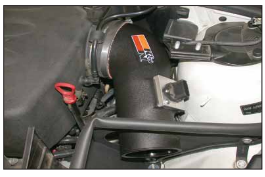
21. Attach the K&N® intake tube to the plenum with the provided hose clamp.

NOTE: Do not tighten hose clamp completely.