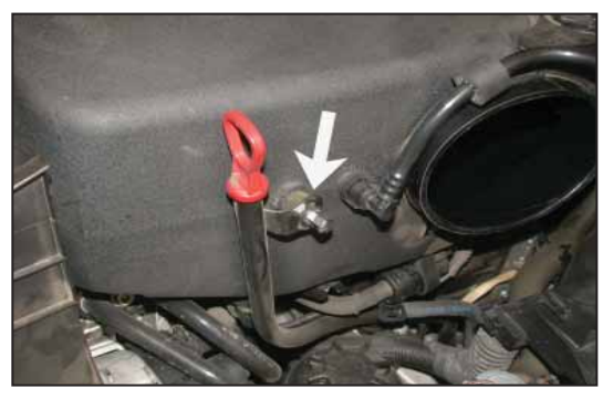
9. Remove the nut that secures the dip stick to the intake plenum.