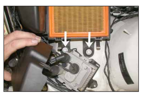
5. Remove the cover to the head light module to gain access to the air box bolts and module nut. Remove the bolts and nut.