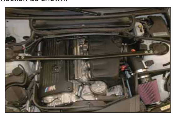
26. Re-install the strut tower brace that was removed in step 2.