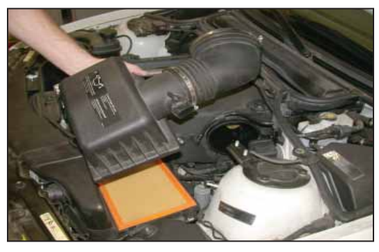
4. Loosen the hose clamp at the intake plenum and release the two clips that secure the air box lid to the vehicle. Remove the upper air box and intake tube as shown.