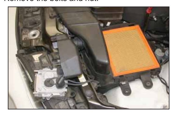
6. Lift the head light module and place out of the way on the core support to gain access to the lower air box for removal.