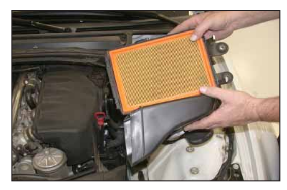
7. Remove the lower air box assembly as shown. NOTE: K&N Engineering, Inc., recommends that customers do not discard factory air intake.