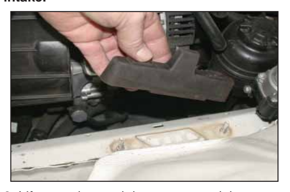
8. Lift up on lower air box mount and then remove from vehicle.