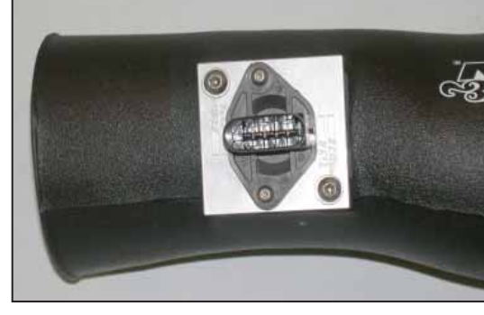
20. Secure the mass air sensor assembly into the K&N® intake tube with the provided hardware as shown

NOTE: Make sure the open end of the mass air sensor faces toward the filter end of the tube.