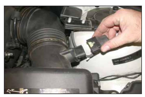
3. Squeeze the two locking tabs together, then remove the mass air electrical connection as shown.