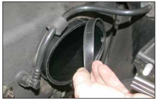
10. Remove the intake o-ring from the plenum as shown.