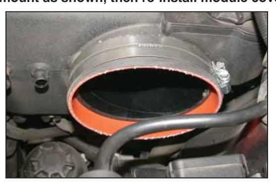
15. Install the silicone hose (08612) onto the intake plunem as shown using the provided hose clamps.