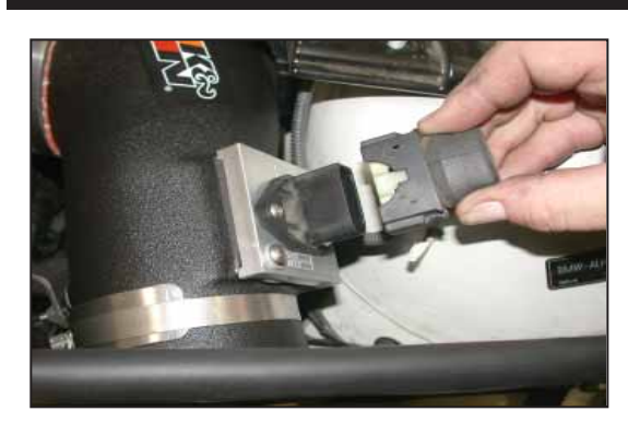
25. Reconnect the mass air sensor electrical connection as shown.