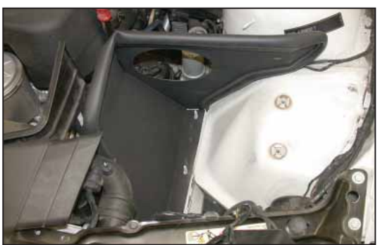
12. Install the heat shield into the vehicle. Make sure the lower air box mounting studs protrude through the heat shield mounting holes.