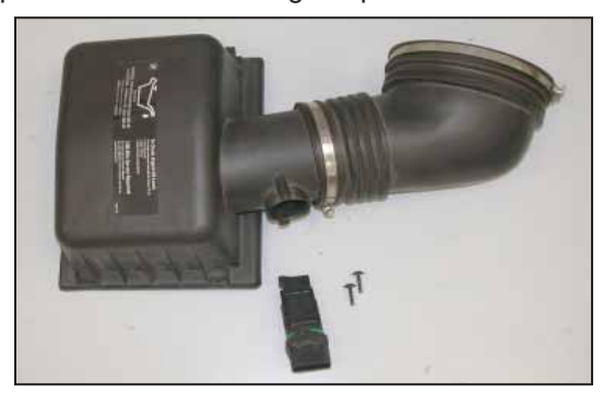
16. Remove the two screws that secure the mass air sensor to the air box with the provided Torx wrench, then remove the mass air sensor.