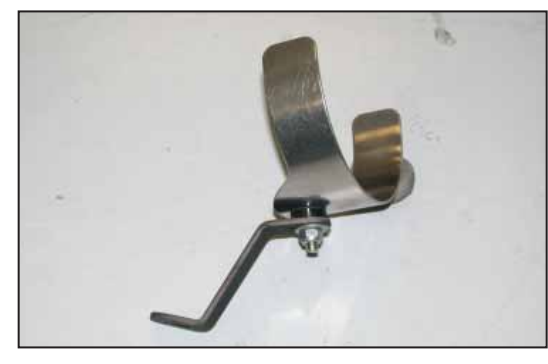
22. Assemble the saddle clamp to the tube bracket (010091) with the provided hardware as shown.

NOTE: Do not tighten hose clamp completely.