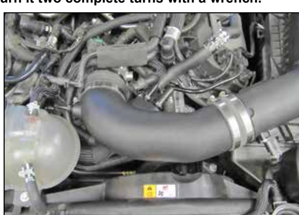
16. Install the K&N® intake tube along with the coupling hose (08536) into the hump hose at the throttle body and then onto the upper air box housing. Secure the hoses with the provided hose clamps.

NOTE: Plastic NPT fittings are easy to cross thread. Install the vent fitting "hand" tight, then turn it two complete turns with a wrench.