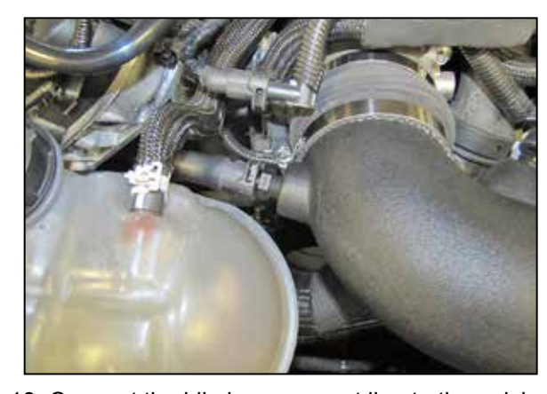
18. Connect the idle by-pass vent line to the quick disconnect fitting installed into the K&N® intake tube as shown.