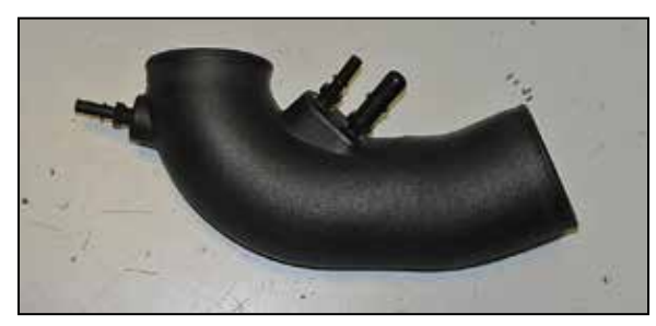
15. Install the three quick disconnect fittings into the K&N® intake tube as shown.

NOTE: On vehicles not eqquipped with an EVAP line, install the provided NPT plug #08032 onto the K&N® intake tube.