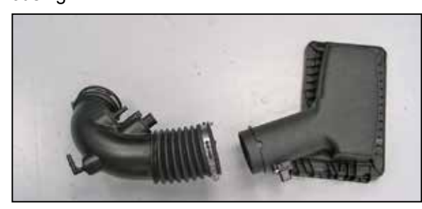
11. Loosen the hose clamp and then remove the factory intake tube from the upper air filter housing