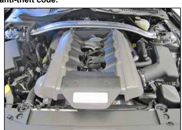
2. Lift up the engine cover to unhook it from its mounts, slide the engine cover from under the strut tower brace and remove it from the vehicle.

NOTE: Disconnecting the negative battery cable erases pre-programmed electronic memories. Write down all memory settings before disconnecting the negative battery cable. Some radios will require an anti-theft code to be entered after the battery is reconnected. The anti-theft code is typically supplied with your owner's manual. In the event your vehicles anti-theft code cannot be recovered, contact an authorized dealership to obtain your vehicles. anti-theft code.