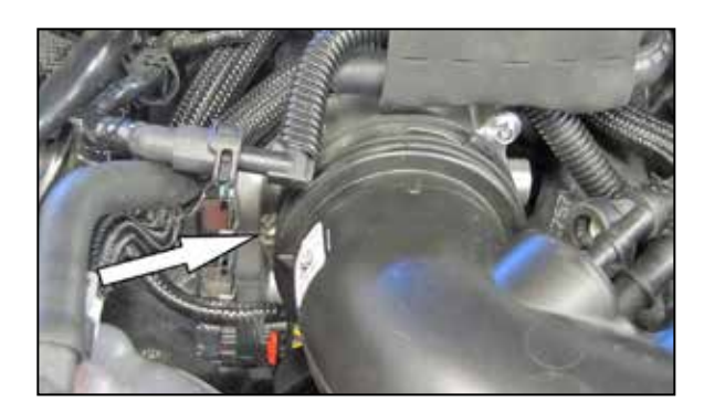
7. Loosen the hose clamp securing the intake tube to the throttle body.