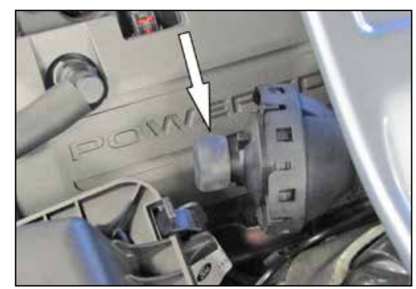
6. Install the provided cap onto the sound drum as