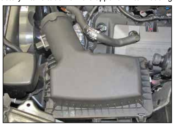
12. Reinstall the upper air filter housing onto the lower housing and secure with the factory retaining clips.