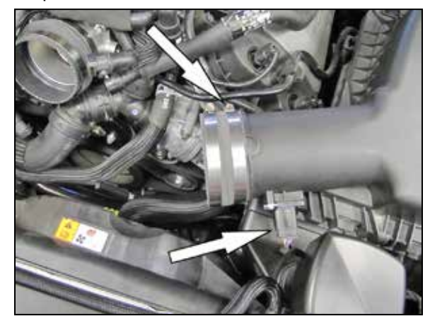
14. Install the provided coupling hose (08563) onto the air filter housing and secure with the provided hose clamp then reconnect the mass air sensor electrical connection.