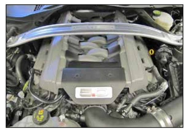
19. Reinstall the Engine cover onto its mounting studs.