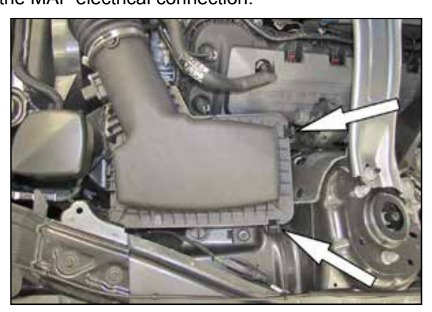
9. Release the two clips securing the air box lid and then remove the lid/intake tube assembly and the factory air filter.

NOTE: K&N Engineering, Inc., recommends that customers do not discard factory air intake.