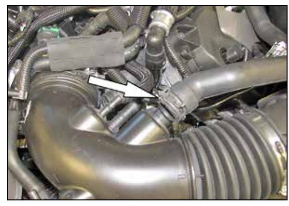
4. Using pliers, squeeze the spring clamp securing the sound tube to the factory intake tube and disconnect the sound tube.

NOTE: Some vehicles are not equipped with the EVAP vent hose.