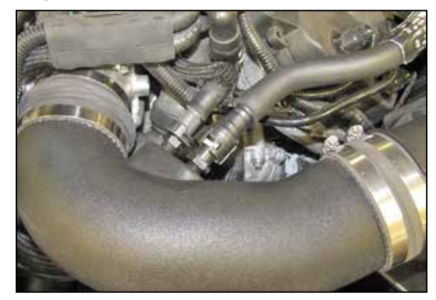
17. Connect the crank case vent and EVAP vent lines to the guick disconnect fittings installed into the K&N® intake tube as shown.