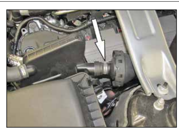
5. Cut the clamp securing the sound tube to the sound drum and then disconnect the sound tube.