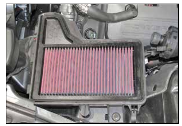
10. Install the K&N® air filter into the lower air filter housing.

NOTE: K&N Engineering, Inc., recommends that customers do not discard factory air intake.