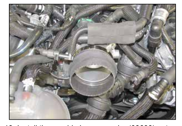
13. Install the provide hump coupler (08699) onto the throttle body and secure with the provided hose clamp