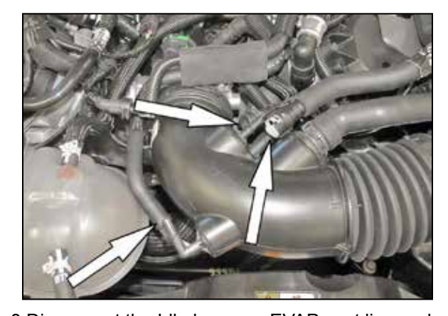
3.Disconnect the Idle by-pass, EVAP vent line and the crank case vent line from the factory intake

NOTE: Some vehicles are not equipped with the EVAP vent hose.