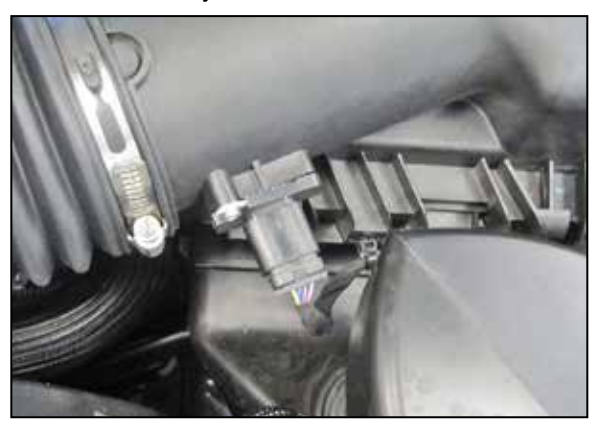
8. Release the red locking tap on the underside of the MAF electrical connector and then disconnect the MAF electrical connection.