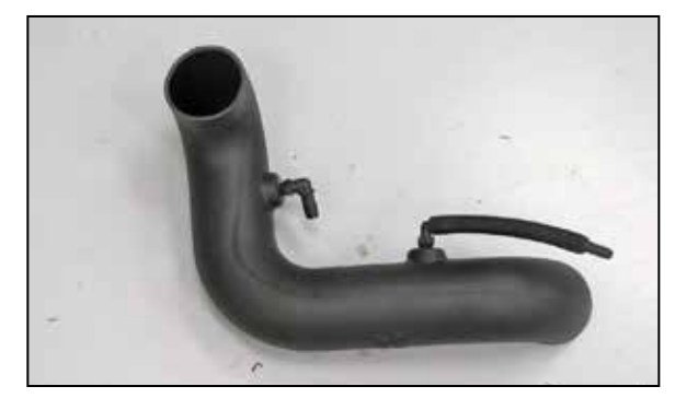
11. Install the 3/8" vent hose assembly onto the 3/8" fitting as shown.