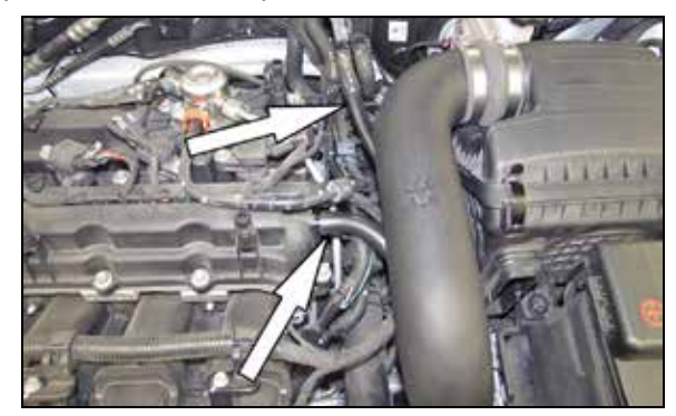
16. Connect the crank case vent line to the valve cover port and connect the EVAP vent line with the union and secure with the factory spring clamp.

15. Install the intake tube assembly into the coupling hose at the throttle body and then into the hose at the air box, secure the tube with the provided hose clamps.