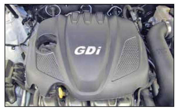
18. Reinstall the engine cover.