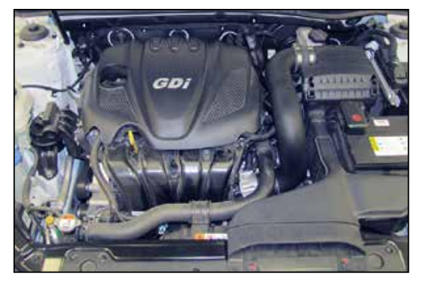
19. Reconnect the vehicle's negative battery cable. Double check to make sure everything is tight and properly positioned before starting the vehicle.

20. The C.A.R.B. exemption sticker, (attached), must be visible under the hood so that an emissions inspector can see it when the vehicle is required to be tested for emissions. California requires testing every two years, other states may vary.