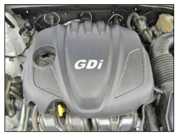
2. Lift up the engine cover and remove it from the engine.

3. Remove the two bolts securing the fresh air intake duct to the core support and then remove the fresh air intake duct from the vehicle. NOTE: These bolts will be reused.