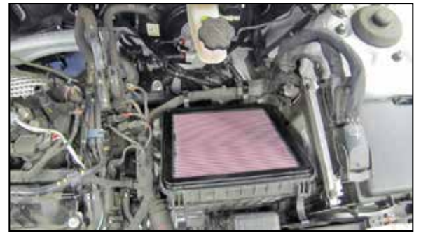
8. Install the provided K&N<sup>®</sup> air filter and then reinstall the upper air box and latch into position.