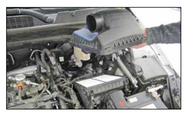
7. Release the four clips securing the upper air box; remove the upper air box and factory air filter.