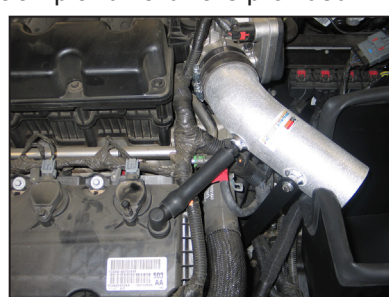
22. Install the provided crankcase vent hose onto the fitting on the valve cover. Then connect the open end to the NPT fitting installed into the K&N® intake tube.