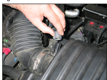
3. Disconnect the inlet air temperature sensor electrical connection.

2. Lift up the engine cover and remove it from the engine.