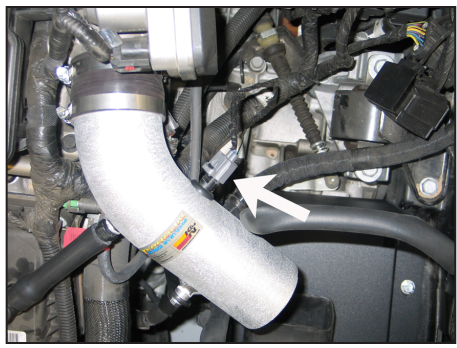
23. Reconnect the inlet air temperature sensor electrical connection.