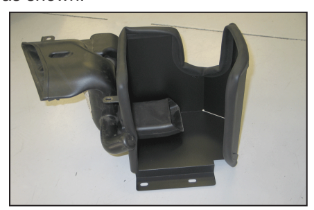
13. Install the fresh air scoop into the heat shield as shown.