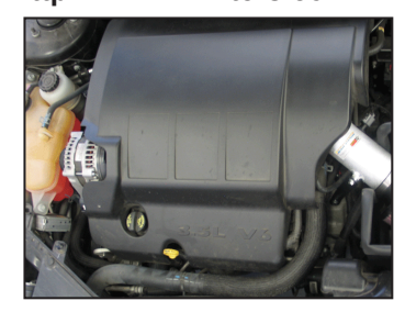
25. Reinstall the engine cover.