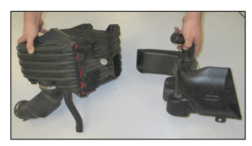
12. Disconnect the fresh air scoop from the airbox as shown.