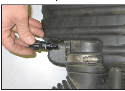
17. Remove the inlet air temperature sensor from the stock intake tube.

NOTE: Plastic NPT fittings are easy to cross thread. Install the vent fitting "hand" tight, then turn it two complete turns with a wrench.