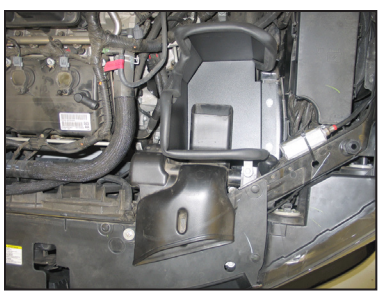
14. Install the heat shield assembly onto the frame rail. Secure the heat shield assembly to the factory airbox mounting locations with the factory bolt and hardware provided. Secure the fresh air intake scoop to the core support using the factory mounting pin.