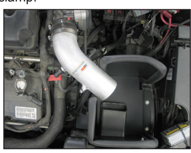
21. Install the K&N® intake tube into the silicone hose at the throttle body, aligning the tube with the mounting bracket. Secure with the provided hose clamp and hardware provided.