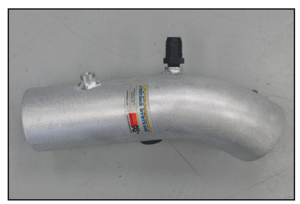
16. Install the provided NPT fitting into the K&N® intake tube as shown.

NOTE: Plastic NPT fittings are easy to cross thread. Install the vent fitting "hand" tight, then turn it two complete turns with a wrench.