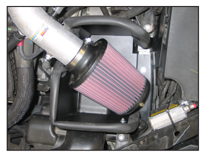
24. Install the K&N® air filter onto the intake tube and secure with the provided hose clamp. NOTE: Drycharger® air filter wrap; part # RX-4730DK is available to purchase separately. To learn more about Drycharger® filter wraps or look up color availability please visit http://www.knfilters.com®.