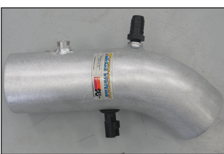
19. Install the inlet air temperature sensor into the grommet installed into the K&N® intake tube. NOTE: Take care installing the temp sensor as it is very fragile.