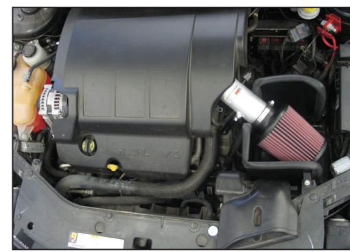
26. Reconnect the vehicle's negative battery cable. Double check to make sure everything is tight and properly positioned before starting the vehicle.