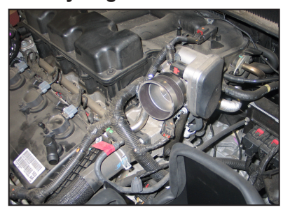
20. Install the provided silicone hose (084036) onto the throttle body and secure with the provided hose clamp.