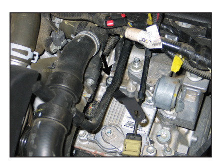
12. Secure the tube mounting bracket to the transmission using the ground strap mounting bolt from step #11.

NOTE: Be sure to place the ground strap between the transmission and bracket.