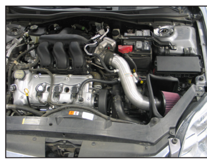
25. Reconnect the vehicle's negative battery cable. Double check to make sure everything is tight and properly positioned before starting the vehicle.