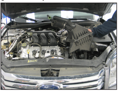
7. Lift up the air box to dislodge it from the mounting grommet and then remove the complete intake assembly.

NOTE: K&N Engineering, Inc., recommends that customers do not discard factory air intake.