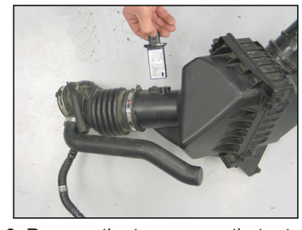
9. Remove the two screws that retain the mass air sensor and then remove the mass air sensor from the air box.