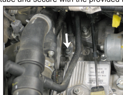
11. Remove the ground strap mounting bolt shown from the transmission.

NOTE: This bolt will be reused in the next step.