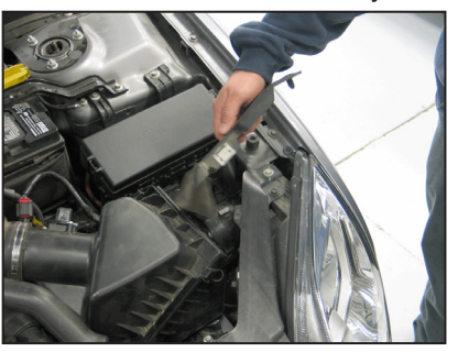
6. Remove the rubber air flap from behind the head light assembly as shown.