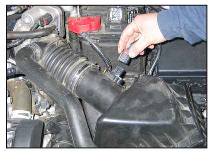
2. Disconnect mass air sensor electrical connection.

NOTE: Disconnecting the negative battery cable erases pre-programmed electronic memories. Write down all memory settings before disconnecting the negative battery cable. Some radios will require an anti-theft code to be entered after the battery is reconnected. The anti-theft code is typically supplied with your owner's manual. In the event your vehicles' anti-theft code cannot be recovered, contact an authorized dealership to obtain your vehicles anti-theft code.