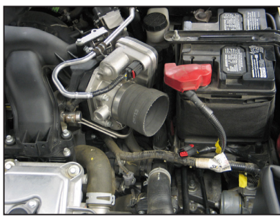
18. Install the silicone hose (08713) onto the throttle body and secure with the provided hose clamp.