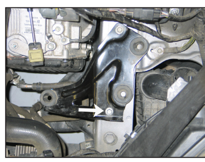
8. Remove the two bolts that secure the air box mount. Then remove the air box mount from the vehicle.

NOTE: K&N Engineering, Inc., recommends that customers do not discard factory air intake.