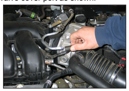
4. On vehicles equipped with an EVAP vent line, disconnect the EVAP vent hose from the tube as shown.