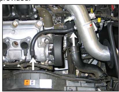
21. Install the provided crank case vent hose onto the valve cover port and then onto the ½"NPT fitting installed into intake tube as shown.