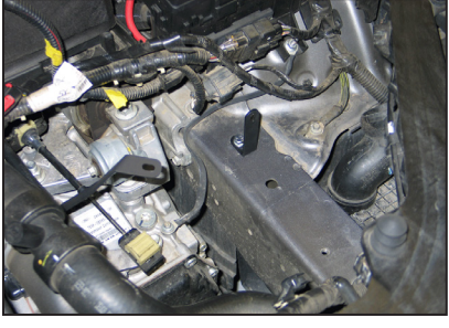
15. Install the heat shield mounting bracket (070602) onto the inner frame rail using the provided hardware as shown.

NOTE: Some trimming of the edge trim will be necessary.