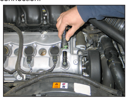
3. Disconnect the crank case vent hose from the valve cover port as shown.