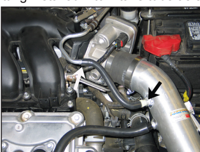
22. On vehicles equipped with an EVAP vent line, install the provided EVAP hose onto the port and then onto the ½"NPT fitting installed into the K&N® intake tube as shown.