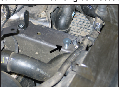
16. Place the heat shield spacer and fender washer onto the frame rail at the front air box mounting location as shown.

NOTE: The mounting bolt will thread into the rear air box mounting bolt location.