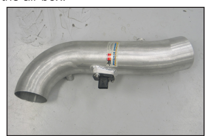
10. Install the mass air sensor into the K&N<sup>®</sup> intake tube and secure with the provided hardware.