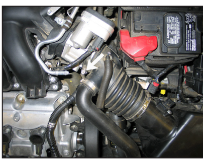
5. Loosen the hose clamp that secures the stock intake tube to the throttle body.