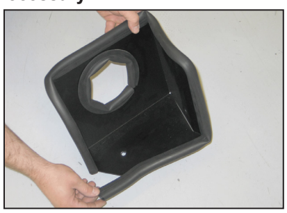
14. Install the long edge trim onto the heat shield as shown.

NOTE: Some trimming of the edge trim will be necessary.