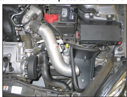
20. Install the K&N® intake tube into the silicone hose at the throttle body and align with the mounting bracket installed in step #12. Secure the intake tube with the hose clamp and hardware provided.

NOTE: Plastic NPT fittings are easy to cross thread. Install the vent fitting "hand" tight, then turn it two complete turns with a wrench.