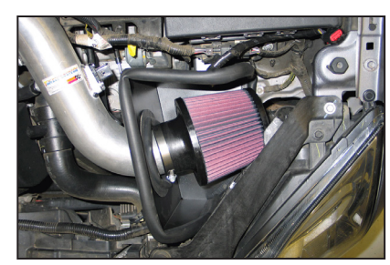
23. Install the K\&N^{\otimes} air filter and secure with the provided hose clamp.

NOTE: Drycharger® air filter wrap; part # RX-4990DK is available to purchase separately. To learn more about Drycharger® filter wraps or look up color availability please visit http://www.knfilters.com®.