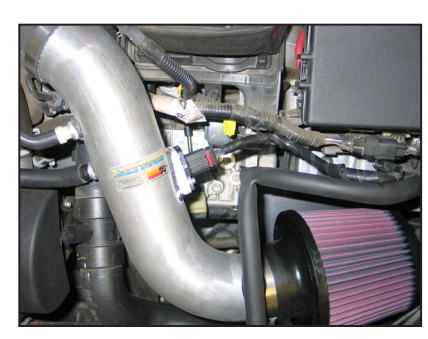
24. Reconnect the mass air sensor electrical connection.

NOTE: Drycharger® air filter wrap; part # RX-4990DK is available to purchase separately. To learn more about Drycharger® filter wraps or look up color availability please visit http://www.knfilters.com®.