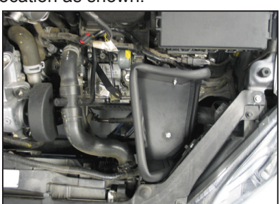
17. Set the heat shield into position on the frame rail and secure with the provide hardware. Secure the rear of the heat shield to the mounting bracket with provided hardware.