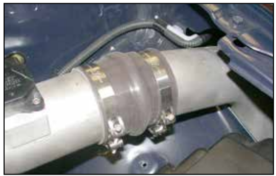
26. Slide the K&N<sup>®</sup> cold air tube through the inner fender from underneath the vehicle and insert the tube into the silicone hump hose as shown above. NOTE: Before installing the intake tube, inspect the inside of the tube for any debris, then clean the inside out with water and a towel. Inspect the tube one more time before proceeding to the next step.