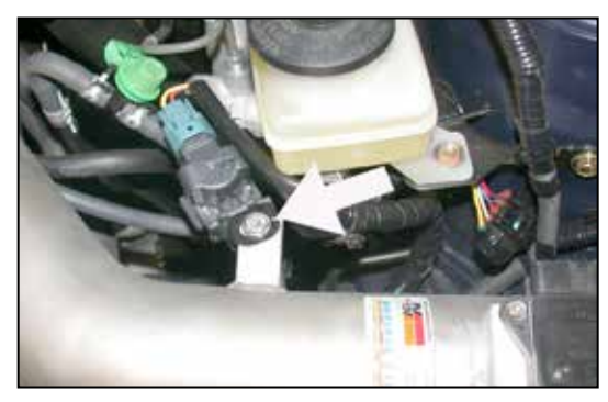
24. Secure the vacuum switching valve to the bracket on the K&N<sup>®</sup> intake tube using the provided hardware as shown.