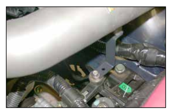
23. Secure the bracket to the rubber mounted stud using the provided hardware but do not tighten at this time.