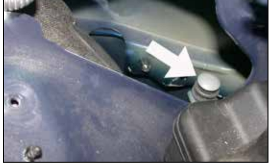
13. Remove the air inlet duct screws from the inner fender as shown.