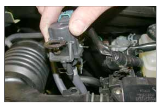
5. Unclip the wire harness from the air cleaner assembly as shown.

6. Using a flat blade screwdriver pry up the vacuum switching valve from the stock intake tube as shown.