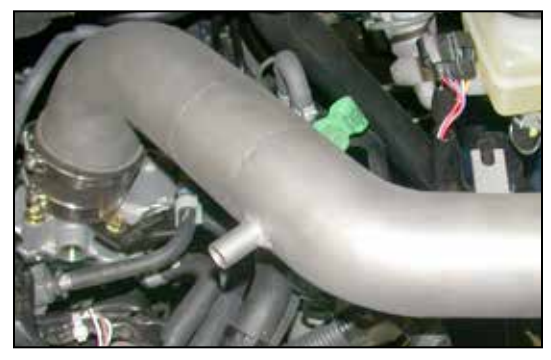
22. Slide the K\&N^{\otimes} intake tube into the silicone hose on the throttle body as shown.