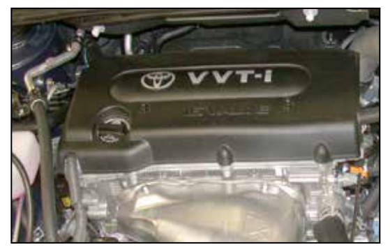
35. Re-install the engine cover.

34. Reverse the removal process and reinstall the front tire and torque to factory specs.