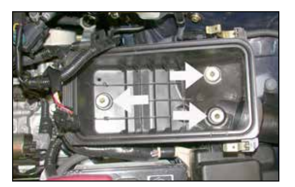
10. Remove the three air lower air cleaner hex bolts as shown.