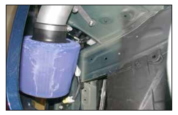
31. Slide the K&N<sup>®</sup> air filter onto the K&N<sup>®</sup> cold air tube and secure with the provided hose clamp as shown.

NOTE: Please be aware the Drycharger<sup>®</sup> is water repellent, not water proof. Depending on conditions and usage the water repellent treatment is good for 1 to 2 years. See the parts list to reorder a new Drycharger<sup>®</sup> if necessary.