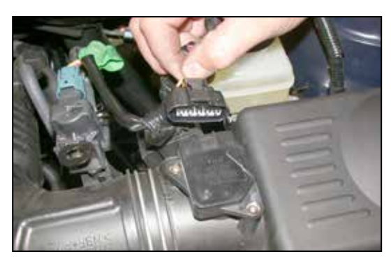
4. Disconnect the mass air sensor electrical connection as shown.