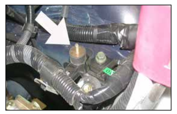
18. Install the rubber mounted stud into the original air cleaner mounting hole as shown.