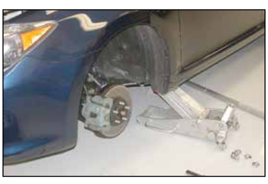
15. Raise the vehicle up and support it with jack stands, then, remove the front tire as shown.