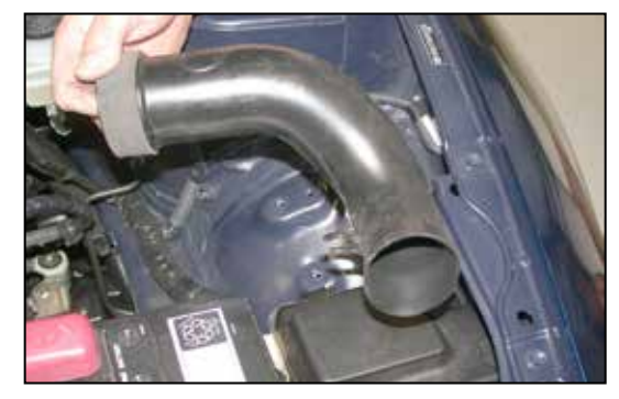
12. Remove the air inlet duct as shown.

NOTE: K&N Engineering, Inc., recommends that customers do not discard factory air intake.