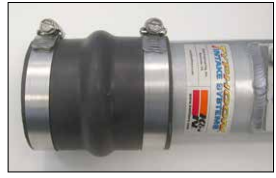
21. Install the provided silicone hump hose and hose clamps onto the K\&N^{\circledast} intake tube and secure as shown.