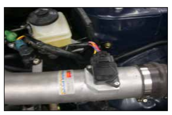
36. Reconnect the mass air sensor electrical connection as shown.