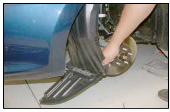
16. Remove four screws and three plastic rivets, then, pull the inner fender valance downward as shown.