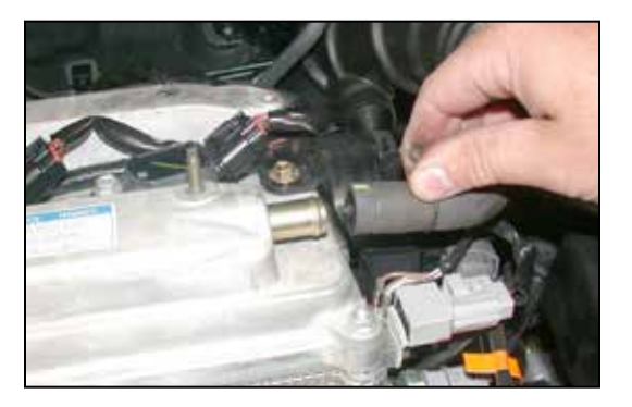
3. Remove the crank case vent hose from the cam cover as shown.

2. Remove the engine cover, which is secured by two acorn nuts as shown.