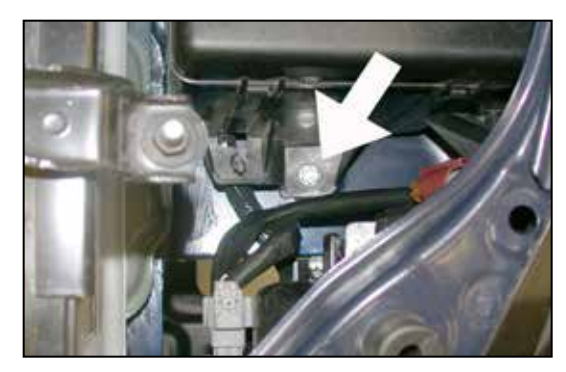
28. Install the provided hex bolt into the fuse box mount from the previous step as shown.