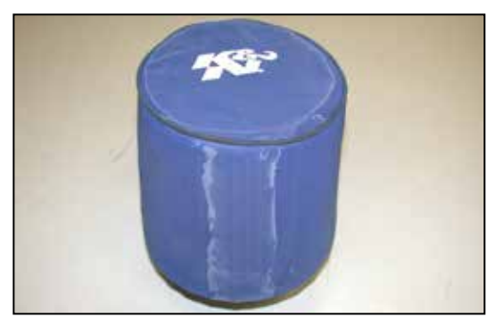
30. Slide the Drycharger<sup>®</sup> onto the K&N<sup>®</sup> air filter as shown above

NOTE: Please be aware the Drycharger<sup>®</sup> is water repellent, not water proof. Depending on conditions and usage the water repellent treatment is good for 1 to 2 years. See the parts list to reorder a new Drycharger<sup>®</sup> if necessary.