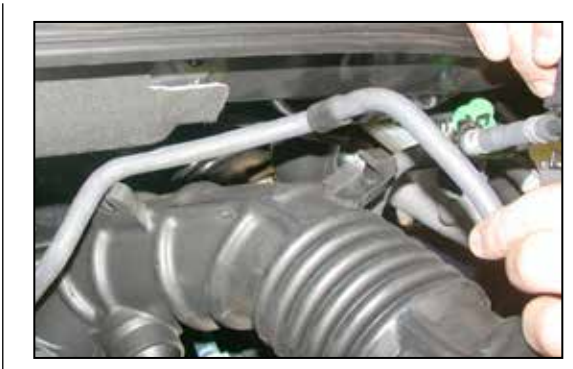
7. Unclip the vent hose from the stock intake tube as shown.