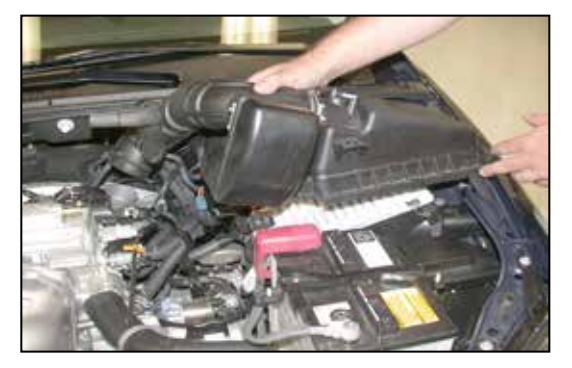
9. Depress the spring clamp on the throttle body, then, remove the complete upper air cleaner assembly as shown.