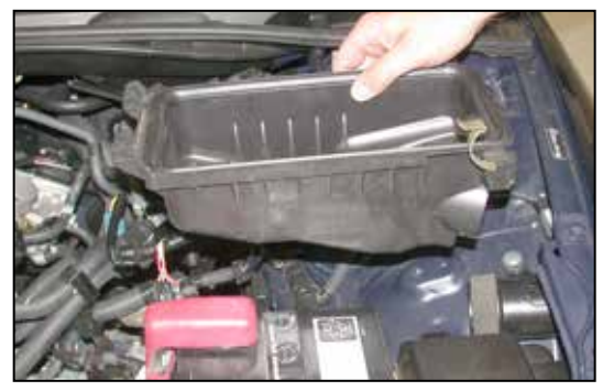
11. Remove the lower air cleaner assembly as shown.

NOTE: K&N Engineering, Inc., recommends that customers do not discard factory air intake.