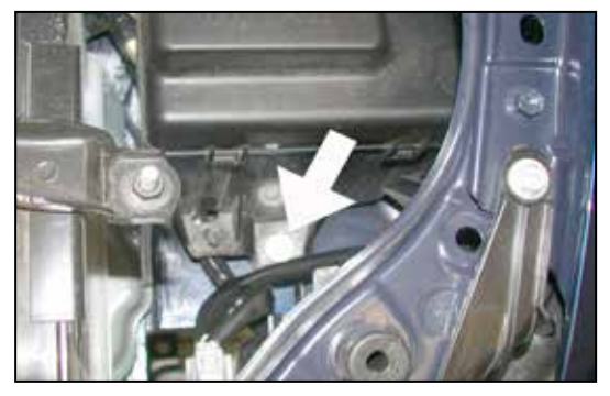
27. Remove the lower fuse box hex bolt as shown above.