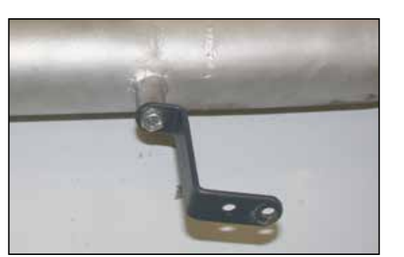
19. Install the provided bracket onto the K&N<sup>®</sup> intake tube and secure with the provided hardware.