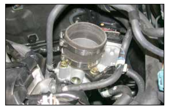
17. Install the silicone hose and hose clamps onto the throttle body as shown.