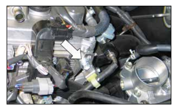
10. Remove the fuel rail mounting bolt shown. NOTE: This bolt will be re-used.