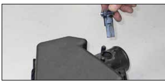
17. Remove the two screws that secure the mass air sensor to the stock air box. Then, remove the mass air sensor as shown.