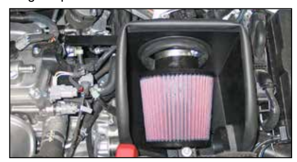
20. Install the K&N<sup>®</sup> air filter and secure with the