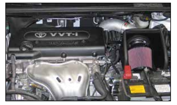
24. Reconnect the vehicle's negative battery cable. Double check to make sure everything is tight and properly positioned before starting the vehicle.

25. It will be necessary for all K&N<sup>®</sup> high flow intake systems to be checked periodically for realignment, clearance and tightening of all connections. Failure to follow the above instructions or proper maintenance may void warranty.