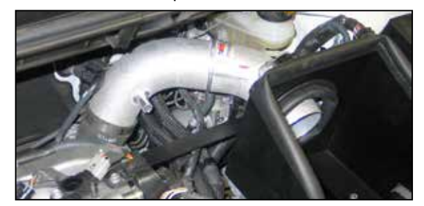
19. Install the intake tube into the silicone hose at the throttle body and align with the mounting bracket. Secure the EVAP bracket and mounting bracket in the same location on the intake tube using the provided hardware.