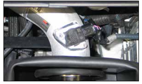
22. Re-connect the mass air sensor electrical connection.