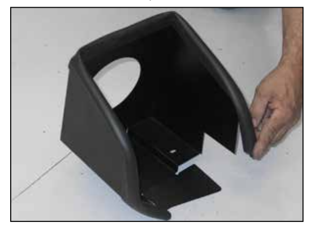
14. Install the long edge trim onto the heat shield as shown.

NOTE: Some trimming of the edge trim may be necessary.