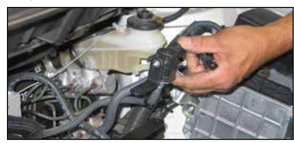
13. Install the provided EVAP bracket onto the EVAP solenoid with the provided hardware.