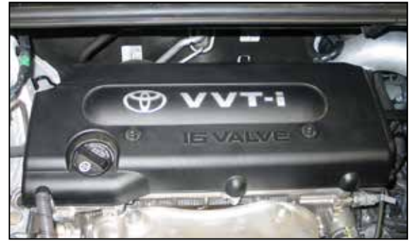
23. Re-install the engine cover and secure with the factory nuts.