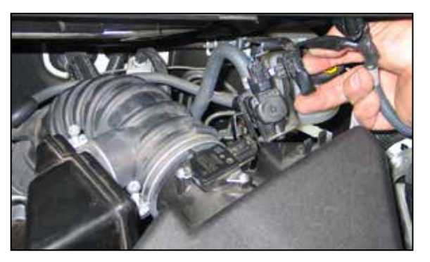
4. Un-hook the EVAP solenoid valve from the stock intake tube as shown.