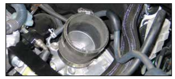
12. Install silicone step hose (#08713) onto the throttle body and secure with the provided hose clamp.