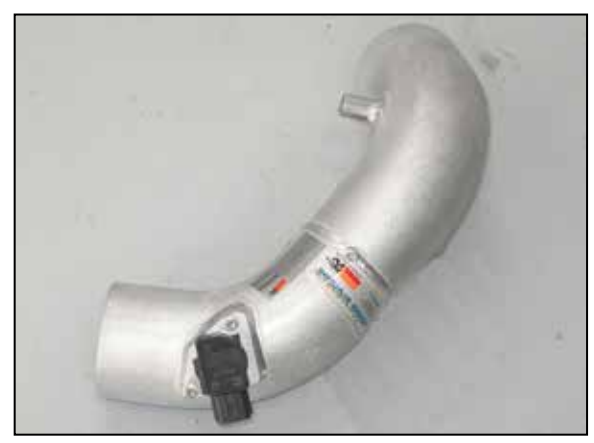
18. Install the mass air sensor into the intake tube and secure with the provided hardware as shown.