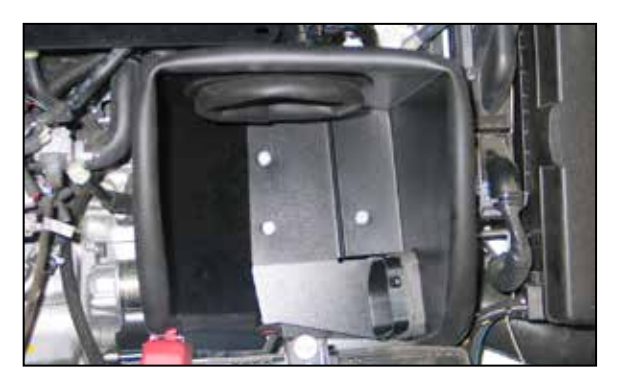
16. Install the heat shield assembly and secure with the provided hardware. NOTE: The fresh air supply tube is to be installed into the heat shield.

NOTE: Some trimming of the edge trim may be necessary.