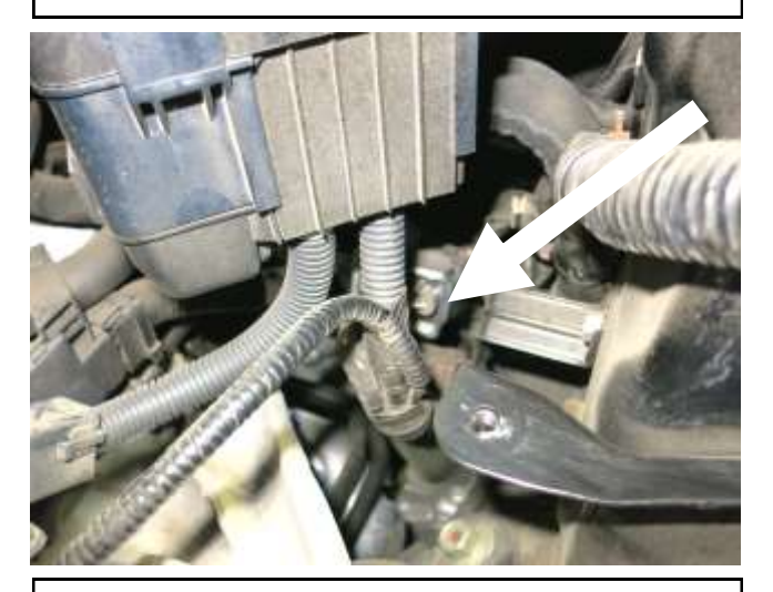
g. Remove the electrical tape that holds the MAF harness to the main wire harness.