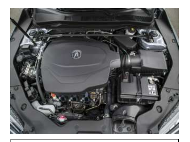
STOCK INTAKE SYSTEM