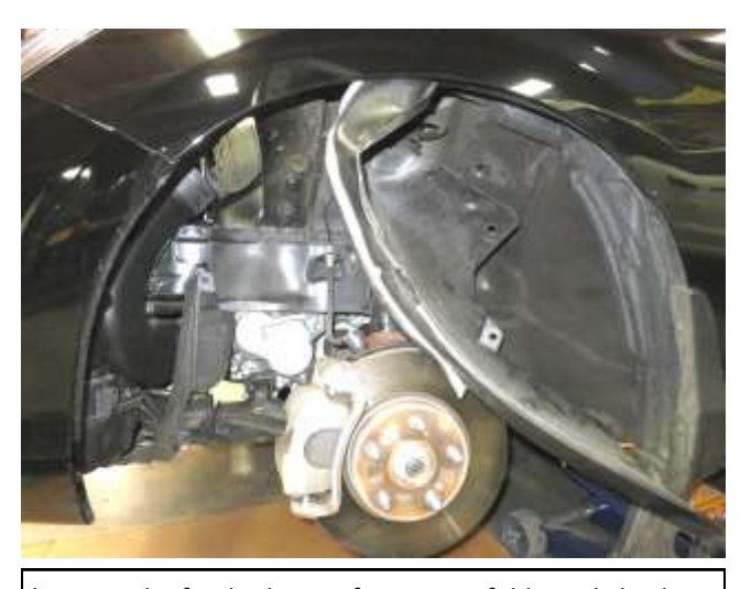
k. Once the fender liner is free, it can fold neatly back behind the brake assembly as shown.