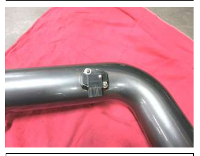
c. Install the MAF sensor with factory screws removed in step 2m onto the AEM intake tube.