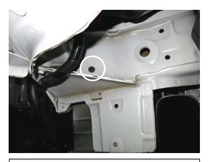
a. Install the provided wellnut into the frame of the vehicle as shown. Note: Use soap and water to ease installation.

a. When installing the intake system, do not completely tighten the hose clamps or mounting hardware until instructed to do so.