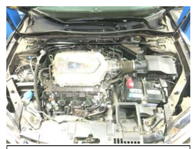
a. Remove the engine cover by lifting straight up.