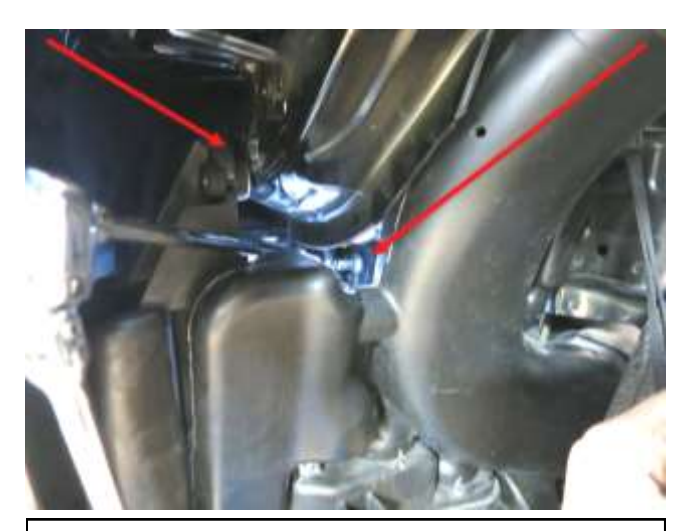
I. First remove the bolt shown above on the left, allowing you to lower the resonator. Using a short 10mm socket and u-joint on the end of at least 14" of extension