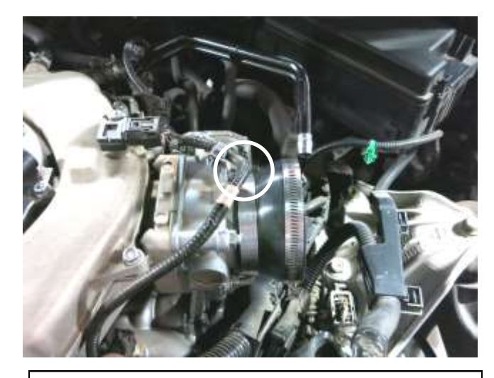
b. Install the included coupler and hose clamps as shown on the throttle body. Tighten the one closest to the throttle body to 30 in-lbs.