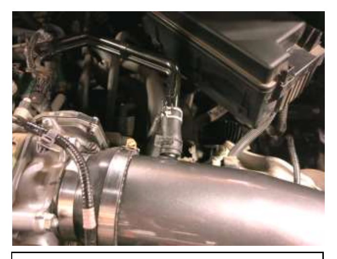
f. Install the provided hose and spring clamp onto the AEM intake tube. Install the vent line into the hose and secure the spring clamp that was removed in step 2c. Note: Trim hose to fit.