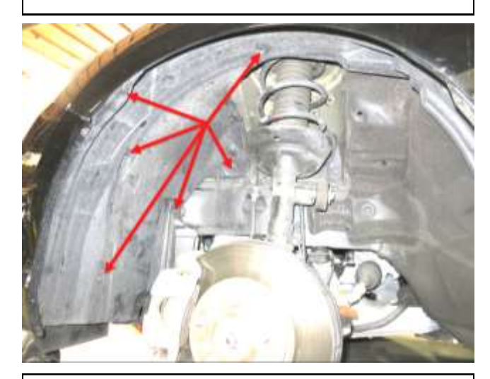
h. Using a flat screw driver, disconnect the six trim panel clips shown above. Disconnect by inserting screwdriver