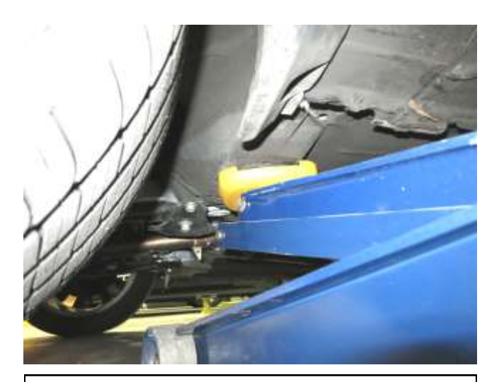
g. Jack vehicle up at a weight bearing location to lift driver-side wheel off the ground, then remove the wheel.