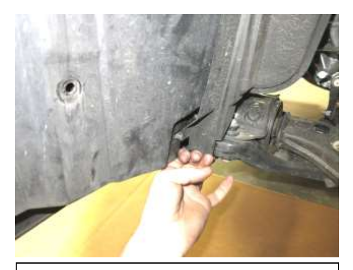
j. Separate the undercarriage panel from the fender liner by rotating them away from each other.