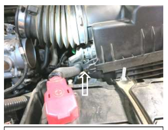
f. Unclip the wiring harness from the stock air box and remove the stock intake system from the vehicle. Note: Do not discard any of your stock equipment.