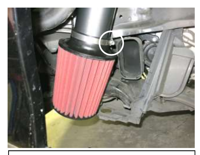
i. Install the AEM filter onto the AEM tube and secure with the provided hose clamp to 30 in-lbs.