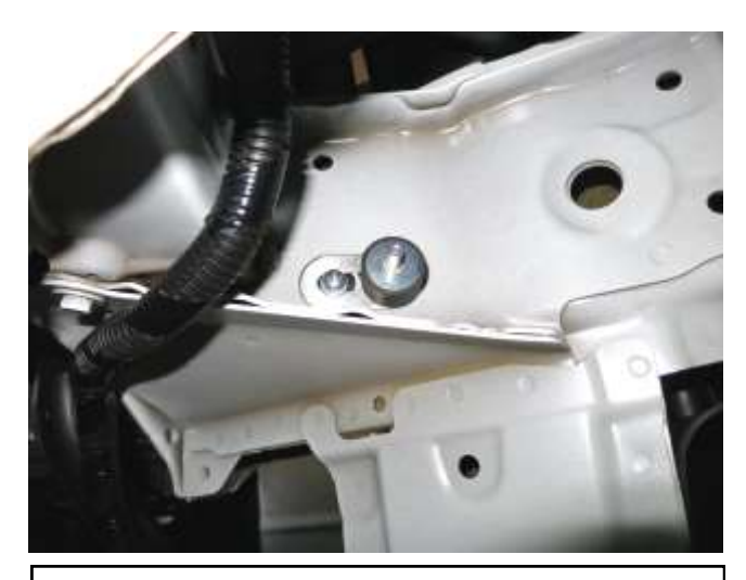
e. Install the rubber mount onto the provided bracket & install the bracket into the vehicle, then secure the screw to the wellnut. Align the AEM intake tube bracket with the mount & secure with provided washer & nut.