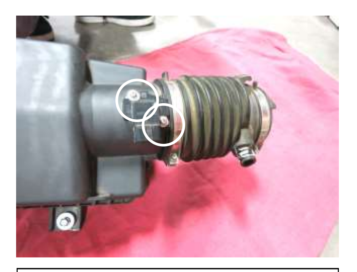
m. Remove the two screws securing the MAF to the stock air box. These will be reused in step 3c.