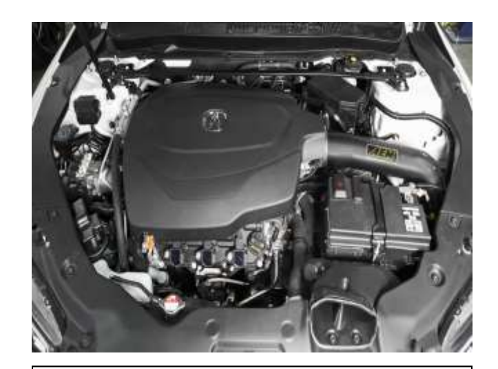
AEM INTAKE SYSTEM