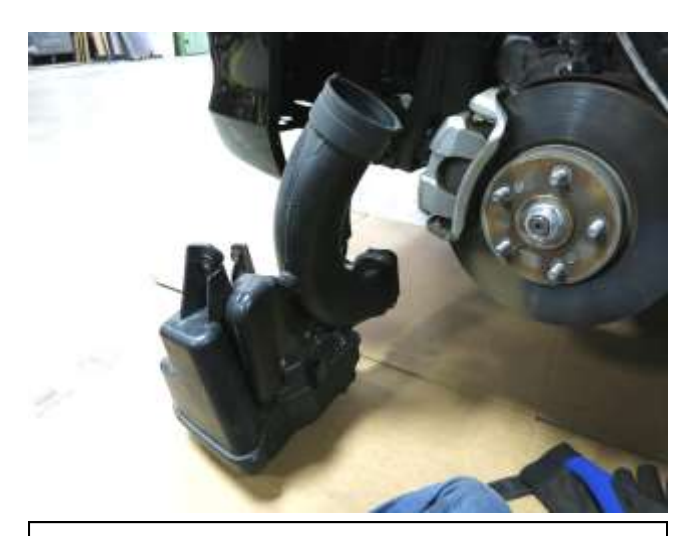
-and remove the bolt on the right. The resonator can then be pulled out as shown above.