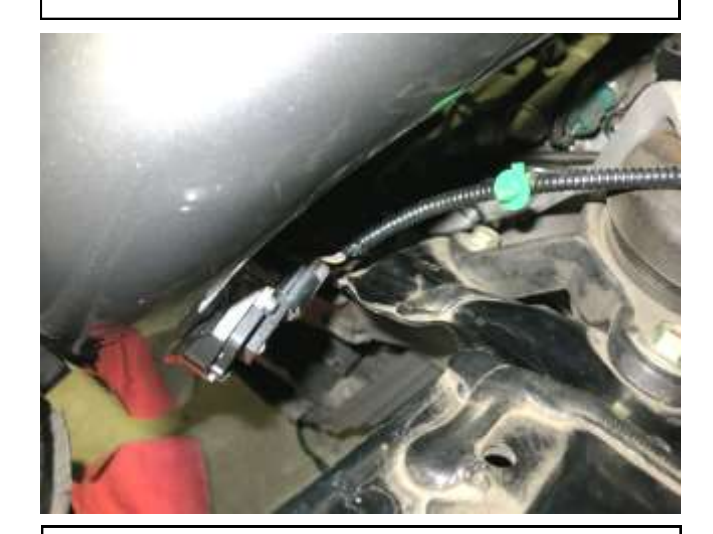
h. Plug the MAF connecter back into the MAF sensor on the AEM intake tube.

j. Reinstall the fender liner and check for clearance at the end of the filter and around the upper edge. If the filter displaces the fender liner, loosen the clamps and bolt, adjust and re-tighten. Reinstall the wheel, taking care to properly torque the wheel to factory specifications. Note: The filter for this application was sized to maximize power output. It may contact the fender liner, but should not displace it. If factory suspension or wheel modification cause contact with the fender liner that pose a risk to the securing of the filter, other filter geometries are available and can be found at http://www.aemintakes.com/search/univcone.aspx.