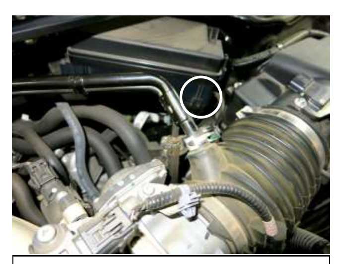
c. Squeeze the spring clamp and remove the vent line from the stock intake duct. This will be reused in step 3f.