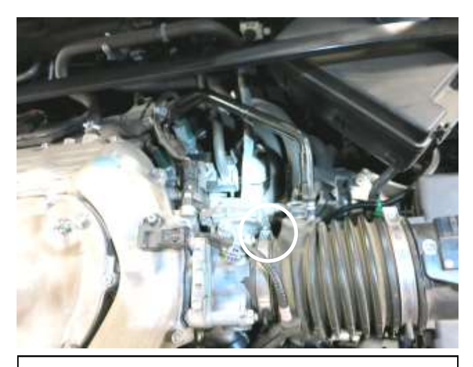
e. Loosen the hose clamp at the throttle body and remove the intake duct from the throttle body.