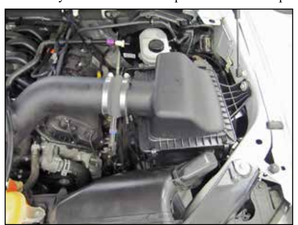
8. Install the AIRAID® intake tube into the coupler at the air filter housing and then into the coupler at the throttle body, adjust the tube for best fit and then secure with the provided hose clamps.