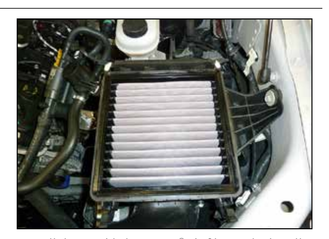
5. Install the provided AIRAID ^{\text{@}} air filter and reinstall the factory upper air filter housing.