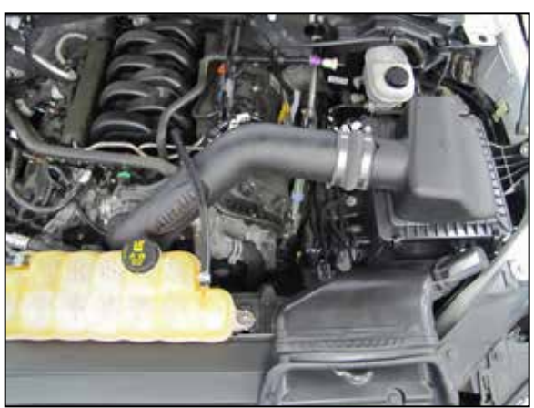
10. Double check your work! Make sure there is no foreign material in the intake path. Make sure all clamps, hoses, bolts, and screws are tight. Double check the hood clearance! Reconnect the negative battery cable!

Thank you for purchasing the Airaid Intake System. Contact Airaid @ (800) 498-6951 8:00 AM - 5:00 PM MST weekdays for questions regarding fit or instructions that are not clear to you. Your Airaid Intake System was carefully inspected and packaged. Check that no parts are missing, or were damaged during shipping. If any parts are missing, contact Airaid. The air filter element is protected from direct exposure to water and debris; care should be taken not to drive through deep water. WATER INGESTION IS THE DRIVERS RESPONSIBILITY! The air filter is reusable and should be cleaned periodically.