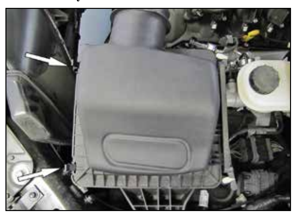
4. Release the two clips that secure the upper air filter housing and then remove the upper housing and factory air filter.

NOTE: AIRAID recommends that customers do not discard factory air intake.