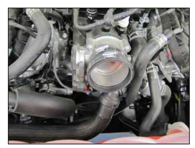
7. Install the provided coupler hose (08615) onto the throttle body and secure with the provided hose clamp.