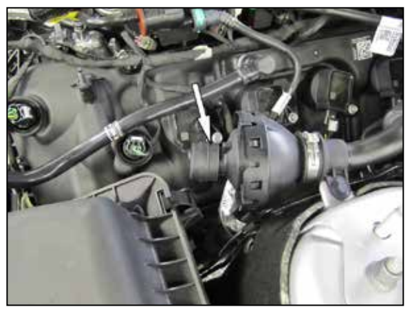
7. Install the provided caplug onto the sound drum.