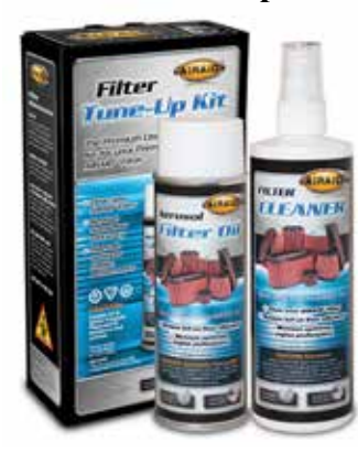
P/N 790-551 Aerosol Spray P/N 790-550 Squeeze Spray