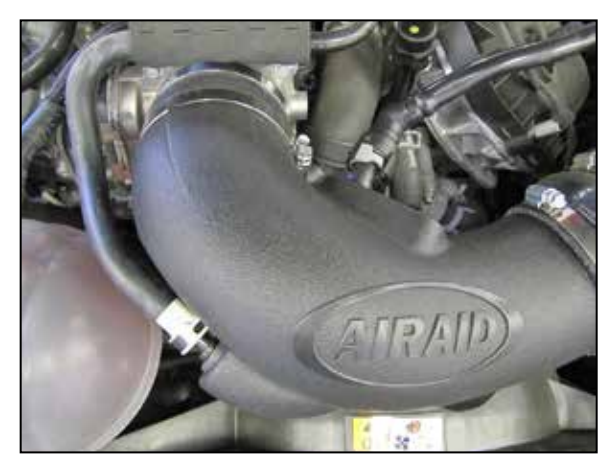
12. Install the AIRAID® intake tube assembly into the coupler hoses, adjust for best fit and then secure with the provided hose clamps. Connect the factory vent lines to the fittings installed into the intake tube.