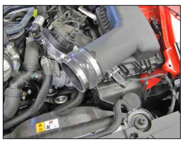
10. Install the provided coupler hose onto the air filter housing and secure with the provided hardware.