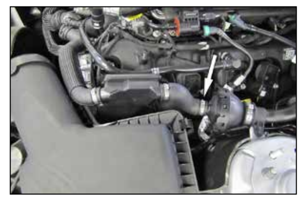
6. Release the one-time use clamp that secures the sound tube to the drum and then disconnect and remove the sound tube from the vehicle.

NOTE: AIRAID recommends that customers do not discard factory air intake.