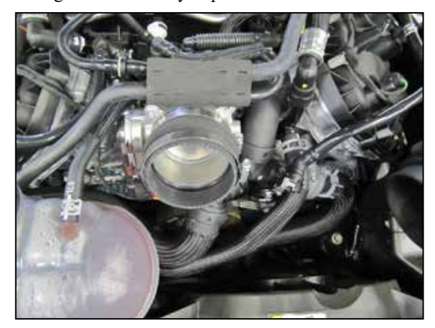
9. Install the provided coupler onto the throttle body and secure with the provided hose clamp.

8. Release the clips the secure the upper air filter housing and then remove the factory air filter. Install the AIRAID® replacement air filter and resecure the upper housing with the factory clips.