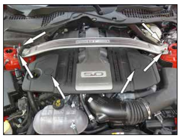
2. Remove the four nuts that secure the strut brace and then remove the strut brace from the vehicle. Pop up the two-round bolt covers.

3. Remove the two nuts that secure the decorative engine cover and remove the cover from the engine.