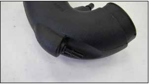
11. Install the provided vent fittings into the AIRAID® intake tube as shown.