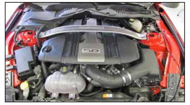
14. Double check your work! Make sure there is no foreign material in the intake path. Make sure all clamps, hoses, bolts, and screws are tight. Double check the hood clearance! Reconnect the negative battery cable!

Thank you for purchasing the Airaid Intake System. Contact Airaid @ (800) 498-6951 8:00 AM - 5:00 PM MST weekdays for questions regarding fit or instructions that are not clear to you. Your Airaid Intake System was carefully inspected and packaged. Check that no parts are missing, or were damaged during shipping. If any parts are missing, contact Airaid. The air filter element is protected from direct exposure to water and debris; care should be taken not to drive through deep water. WATER INGESTION IS THE DRIVERS RESPONSIBILITY! The air filter is reusable and should be cleaned periodically.