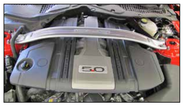
13. Reinstall the strut brace and decorative engine cover.