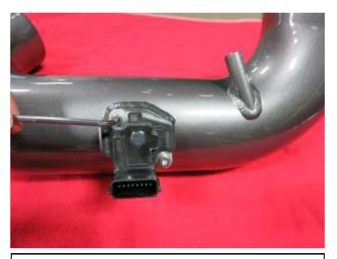
a. Use the provided bolts(07733) to install the MAF sensor into the AEM tube(AEM-2-1533C).

a. When installing the intake system, do not completely tighten the hose clamps or mounting hardware until instructed to do so.