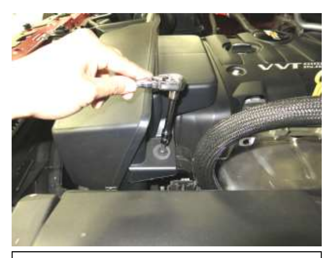
b. Use a T30 Torx bit to remove the indicated bolt on the upper intake resonator.