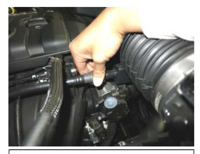
e. Disconnect the breather hose located at the rear of the stock intake tube.