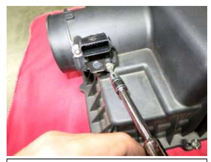
h. Use a T20 Torx bit to remove the MAF sensor from the airbox lid.