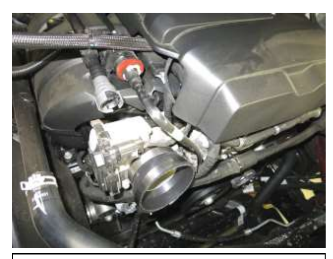
b. Install the coupler(084034) and hose clamps(AEM-9444 and AEM-9452) onto the throttle.