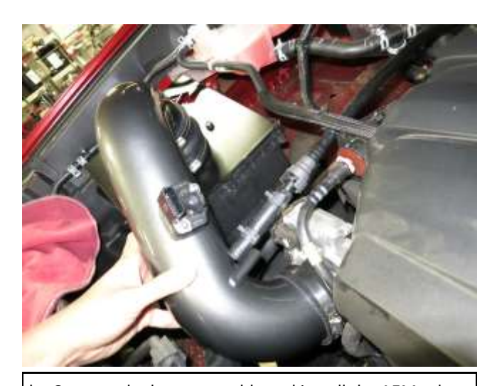
h. Connect the hose assembly and install the AEM tube as shown.