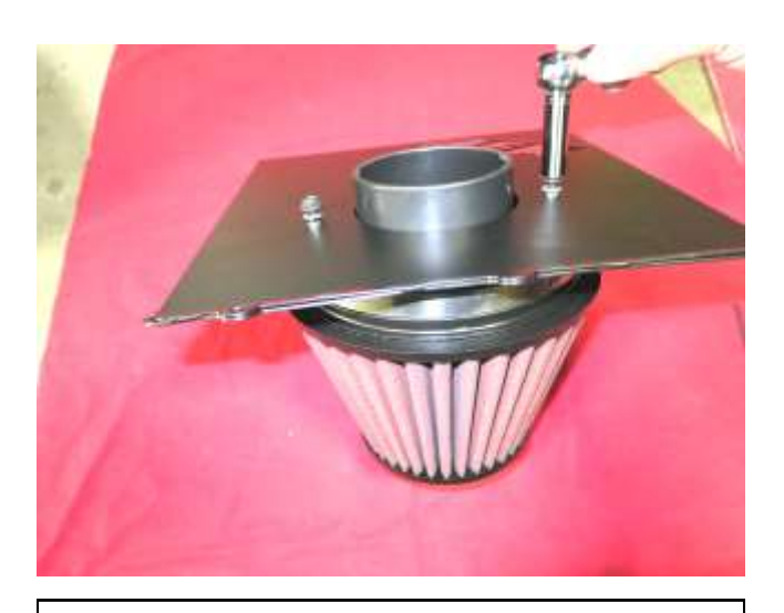
d. Fasten the adapter to the heat shield(AEM-20-8552) using the crush washers(AEM-1-3025) and m6 bolts (AEM-1-2110) provided.