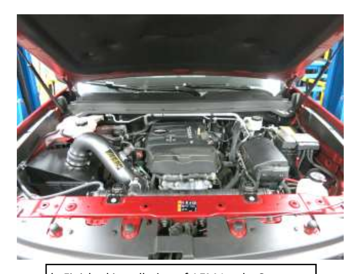
I. Finished installation of AEM Intake System.