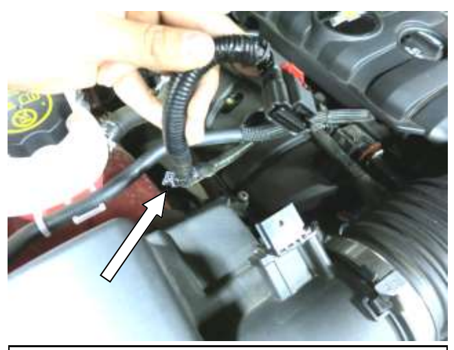
a. Disconnect the wire harness from the MAF sensor. Carefully pry off the wire mounting clip from the airbox lid.