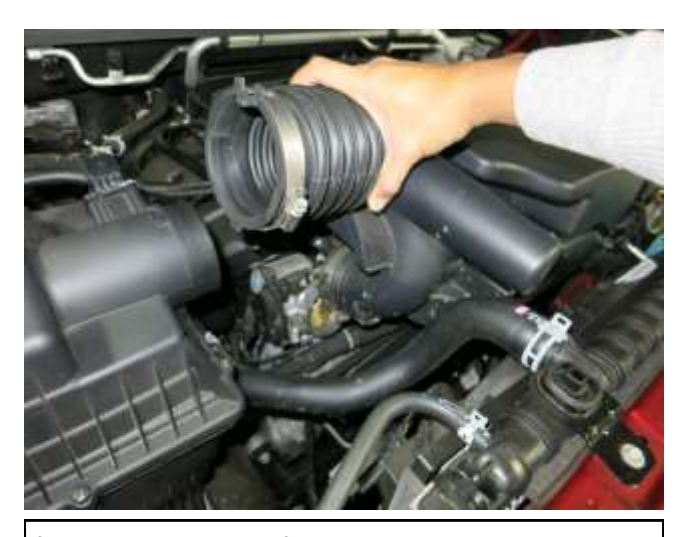
f. Slide the couplers off the airbox lid and throttle to remove the upper resonator assembly.