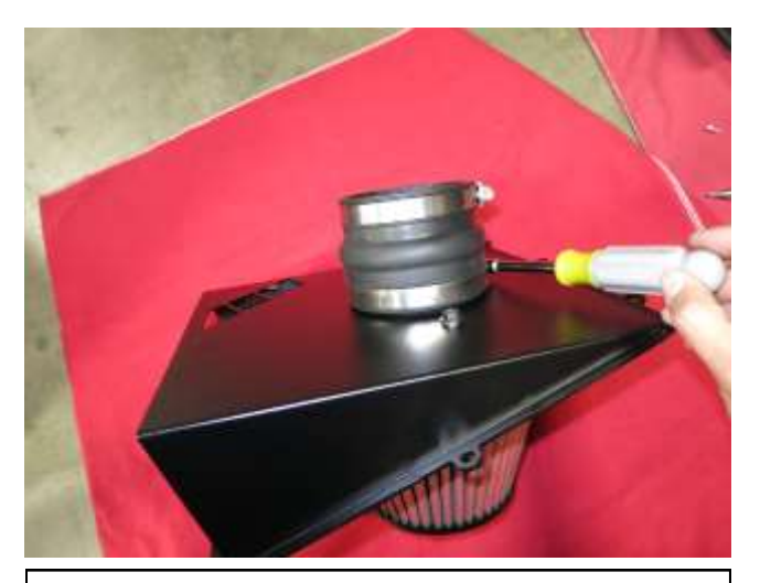
e. Install the hump hose(08657) and fasten it to the adapter using the hose clamp(AEM-9456). Slide hose clamp(AEM-9452) onto the other end.