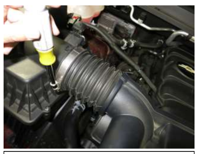
d. Loosen the hose clamp securing the bellow coupler to the airbox lid.