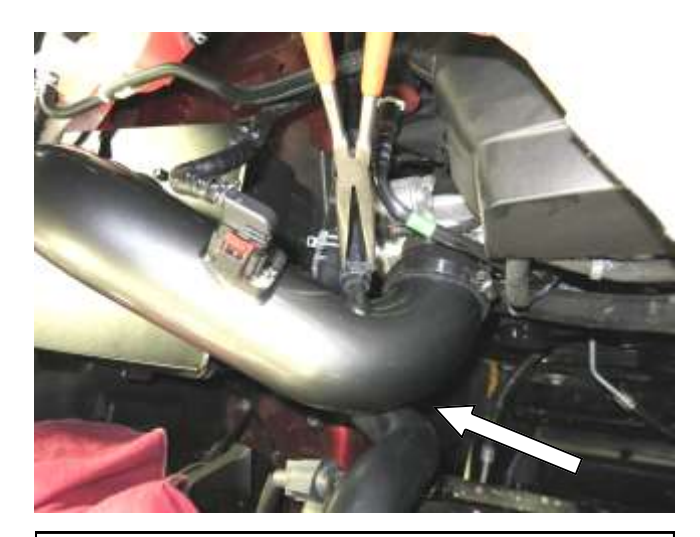
i. Use pliers to slide the spring clamp over the welded nipple. Reconnect the MAF harness to the sensor. Check for clearance with coolant hose and tighten hose clamps.