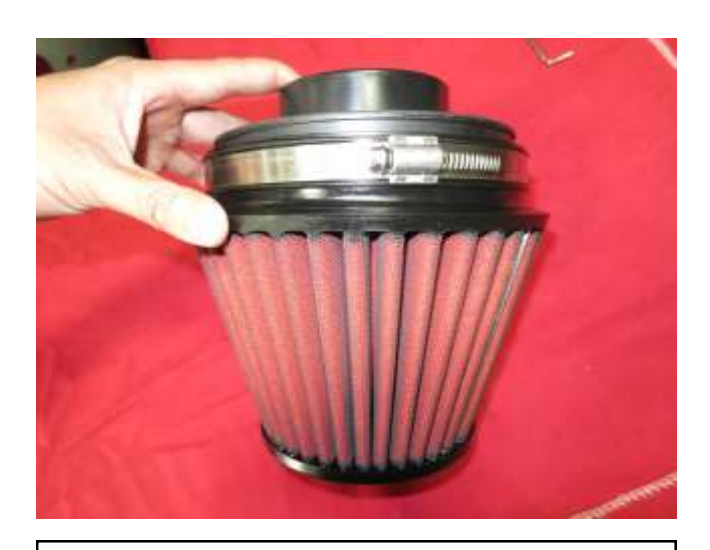
c. Insert the filter adapter(21512-1) into the filter(AEM-21-209D)and fasten with the hose clamp(AEM-94104) provided.