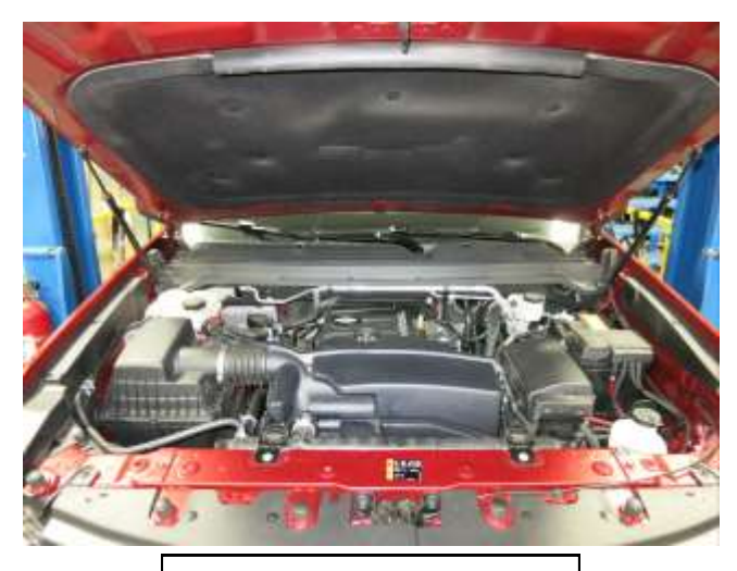
k. Factory air induction system.