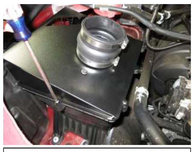
f. Fasten the heat shield to the stock lower airbox using the 4 screws(AEM-1-1020) provided.