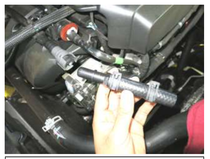
g. Assemble the hose(087028) with the spring clamps (08553) and quick disconnect nipple(082628) provided.