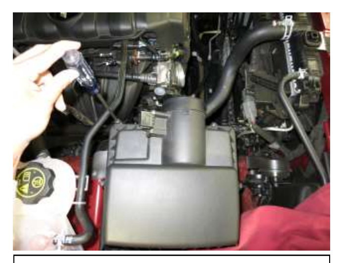
g. Use a phillips screwdriver to remove the 4 screws securing the airbox lid to its base.