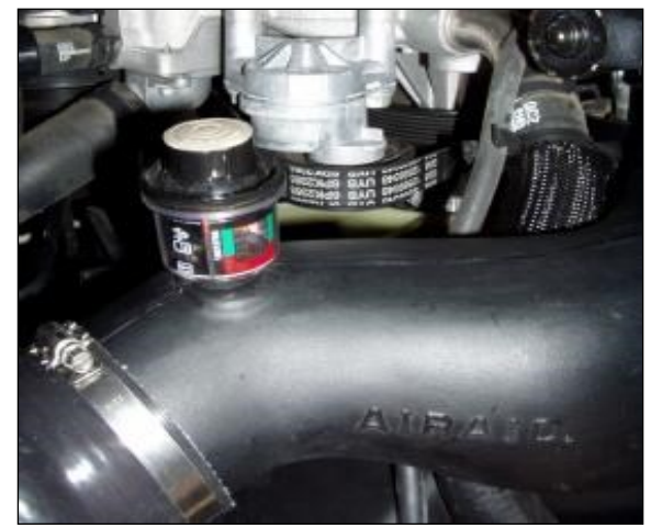
Optional: Installation of Factory Filter Minder in MIT Tube