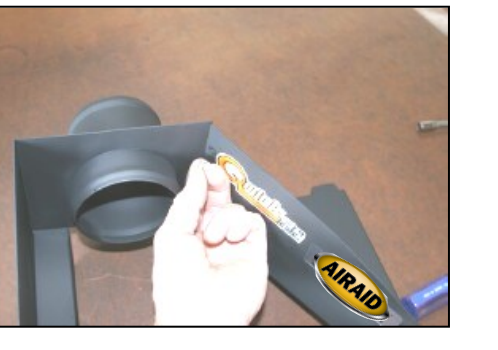
5. Assemble the Quick Fit panels (#2, #3) using four 6-32x 5/16" screws (#5), #6 flat washers (#6), and 6-32 keps nuts (#7). Apply the Airaid Foil Decal onto the Panel as shown.