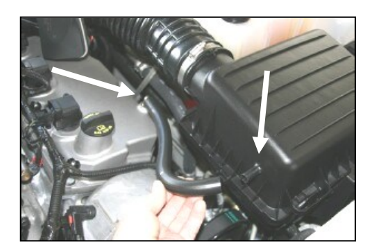
Disconnect the negative battery cable. Remove the breather hose from the factory air box lid and valve cover. 2.7L Engines: remove the hard plastic breather tube at the elbow near the back of the valve cover.

Full color instructions can be viewed on our web site at Airaid.com. Use the Product Search function to find your part number, and click View Details.