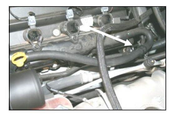
10. For 2.7L Engines : After installing the Quick Fit Panels, ( Refer to step #7 ), connect the breather hose to the factory elbow at the back of the valve cover using one #16 speed clamp. (Factory intake tube removed for instruction purposes).