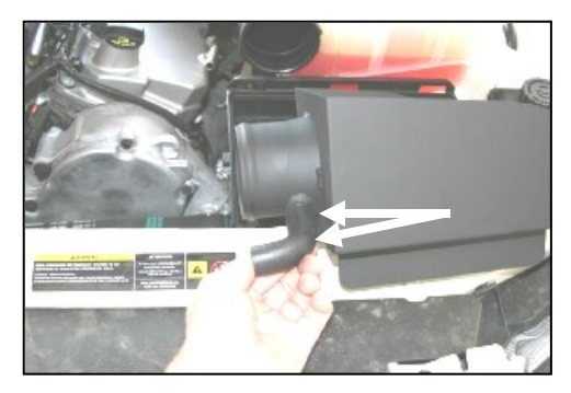
6. Slide the 1/2" rubber elbow (#8) onto the breather fitting on the side of the Quick Fit panels. Install 2 #18speed clamps (#9), one over each end of the elbow, (<u>Do not tighten the</u>