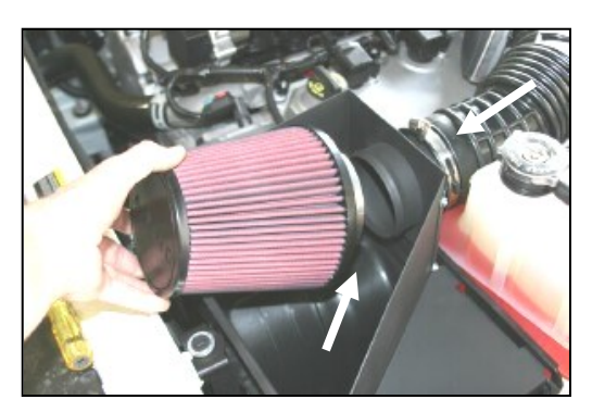
11. Slide the Airaid Premium Filter (#1) onto the Quick Fit panel tube, and tighten the hose clamp. Install the factory intake tube onto the opposite end of the Quick Fit panel tube, and tighten the hose clamp. Tighten the speed clamps on the breather hose, and the 1/2" rubber elbow.