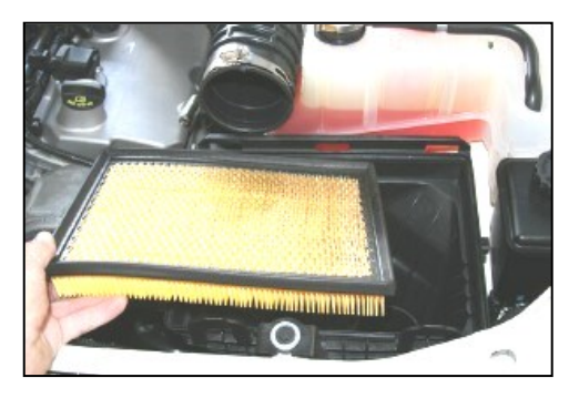
4. Remove the factory air filter from the bottom of the airbox.