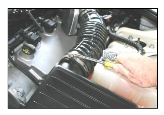
2. Loosen the hose clamp on the factory intake tube, located at the air box lid.