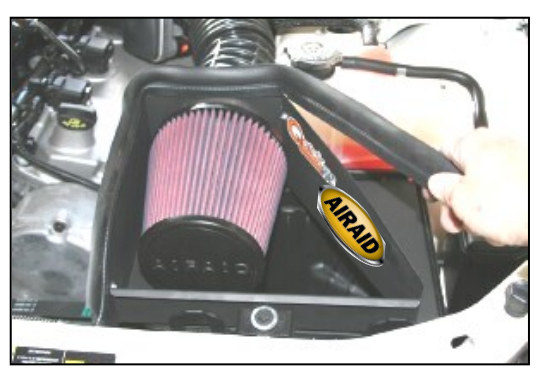
12. Install the weather strip (#4) on the top of the Quick Fit panels. (Hint: Start at one end and work all the way to the other end).