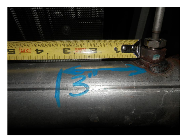
Step 1. Begin removal by removing the secondary O2 sensor at the over axle pipe of the OEM system. Next, cut the OEM inlet pipe 3.00" rearward of the O2 sensor behind the DPF.