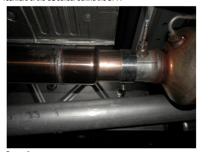
Step 2. There are two inlet pipe assemblies in the kit. 1. Wheelbase of 128.3" requires 6.5" Nipple. 2. Wheelbase of 140.5" requires 15.5" extension pipe and 6.5" Nipple. Begin installation of your new MAGNAFLOW system by loosely attaching the Inlet Pipe Assembly to the DPF outlet pipe you have just cut using the supplied 2.75" and 3.50" clamps. Engage the welded hangers to the rubber insulators. Reinstall the secondary O2 sensor.