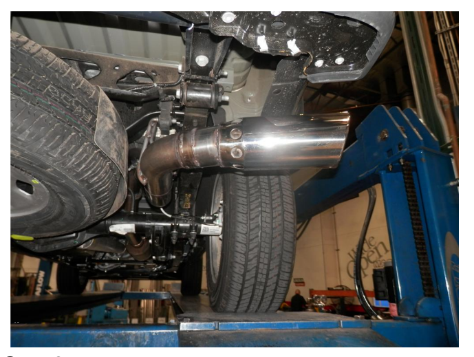
Step 3. Loosely attach the Tail Pipe Assembly using a similar fashion. Keep all fasteners loose for final adjustment.