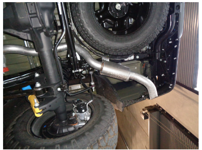
Step 1. To remove the OE exhaust system begin by unfastening the 2 bolt flange located in front of the muffler and loosening the clamp between the front and rear mufflers (over the rear axle). Working front to rear disengage the hangers from the rubber insulators and remove the exhaust. Do not damage the rubber insulators as they will be used to install the new exhaust system.