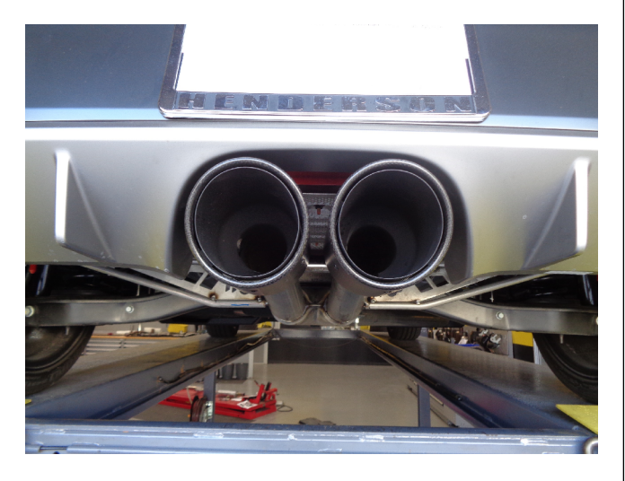
Step 5 . Once a final position has been chosen for the new exhaust system, evenly tighten all clamps from front to rear using the torque specifications on page one of the instructions. Inspect all fasteners after 25-50 miles of operation and re-tighten if necessary.