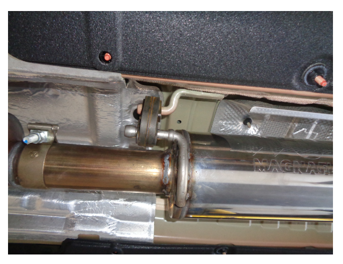
Step 2. Begin installation of your new MAGNAFLOW system by slipping the Resonator Assembly inlet end over the Catalytic Converter outlet. Loosely secure using the supplied 2.36" clamp. Leave all clamps loose during initial installation.