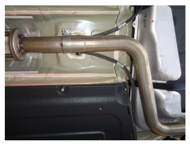
Step 3. Next, install the Mid-Pipe Assembly using the supplied 2.50" clamp.