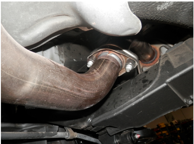
Step 1. To remove the OE exhaust you will need to cut the exhaust pipe 3.00" rearward of the catalytic converter as shown (remove heatshield first). Deburr the cut edges. Unbolt the flange junction beween the OE mid pipe and muffler assembly. Disengage all welded hangers from the rubber insulators. Retain rubber insulators as they will be needed to install your new MAGNAFLOW system. The OEM system can now be removed.