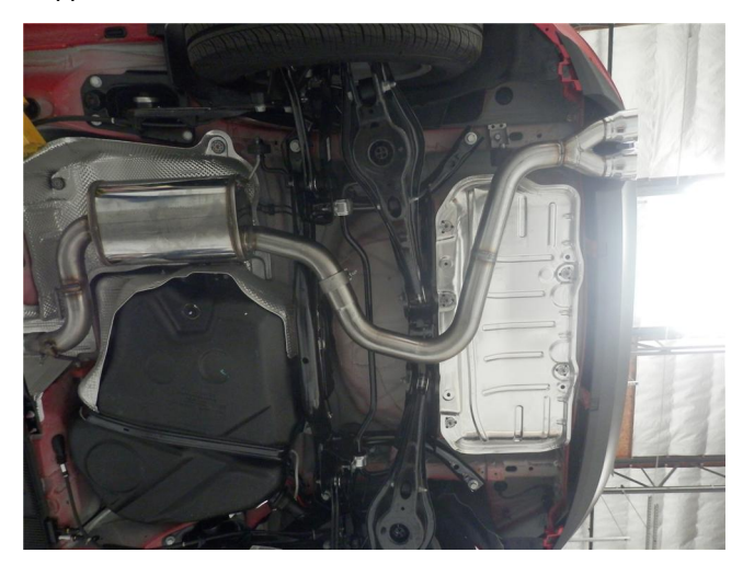
Step 3. Next Install the Tailpipe Assembly using the supplied 2.50" clamp and fit the welded hanger into the rubber insulator. Re-attach the tubular cross brace.