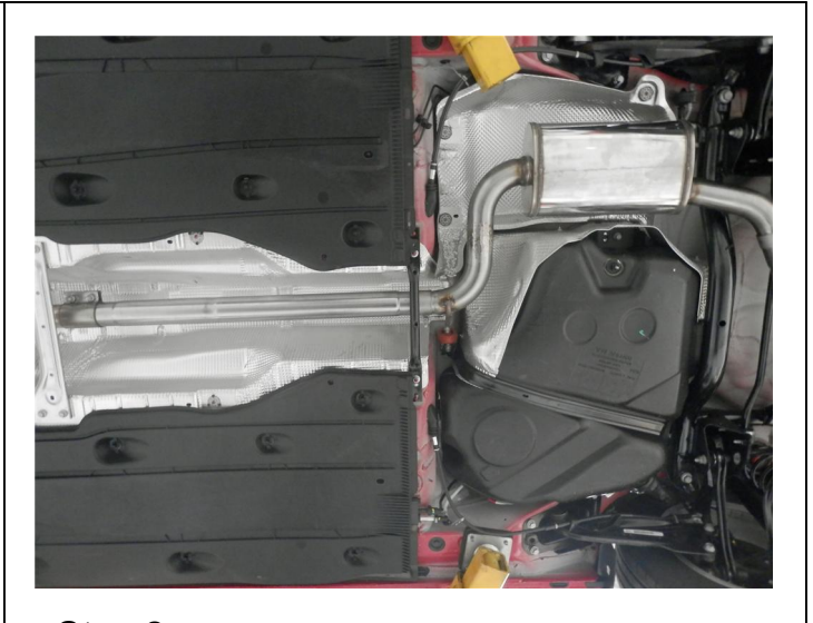
Step 2. Begin installation of the new system by attaching the Inlet Pipe to the factory outlet using the OEM clamp and fit the hanger into the rubber insulator. Leave all clamps loose until final adjustment. Next Install the Muffler Assembly using the supplied 2.50" clamp and fit the welded hanger on the assembly to the previously un-used hanger on the underside of the vehicle using the supplied rubber insulator.