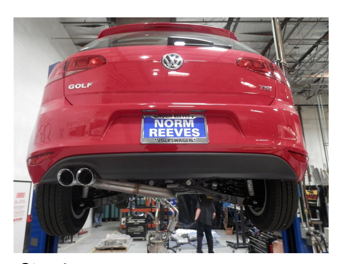
Step 4. Once a final position has been chosen for the new exhaust system, evenly tighten all clamps from front to rear using the torque specifications on page one of the instructions. Inspect all fasteners after 25-50 miles of operation and re-tighten if necessary.