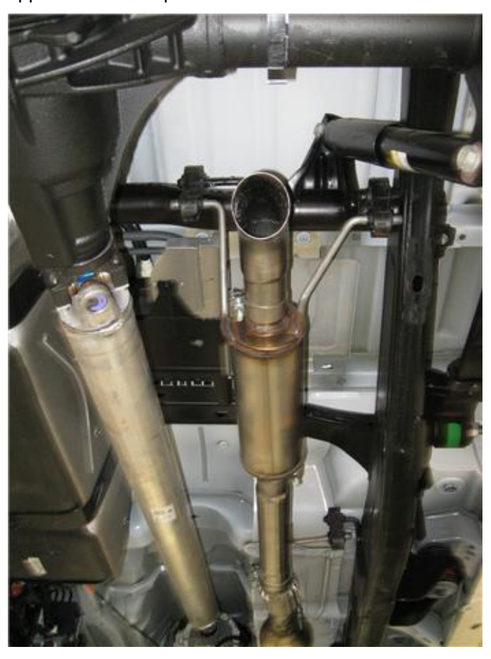
Step 3. Install the Mufflerr Assembly and tail pipe following the same procedure using the supplied 2.50" clamps and by fitting the welded hangers into the OEM rubber isolators. Leave all clamps and fasteners loose for final adjustment of the complete system.