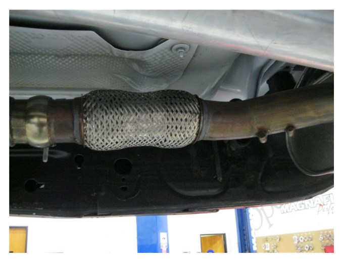
Step 1. To Remove the OEM system, you will need to cut the exhaust pipe behind the muffler before it goes over the axle. Next disengage the welded hangers from the rubber insulators and remove the tail pipe. Unclamp the muffler inlet from the catalytic converter at the clamp junction. Do not damage or discard the OEM fasteners or rubber isolators, as they will be reused to mount your new MAGNAFLOW system.