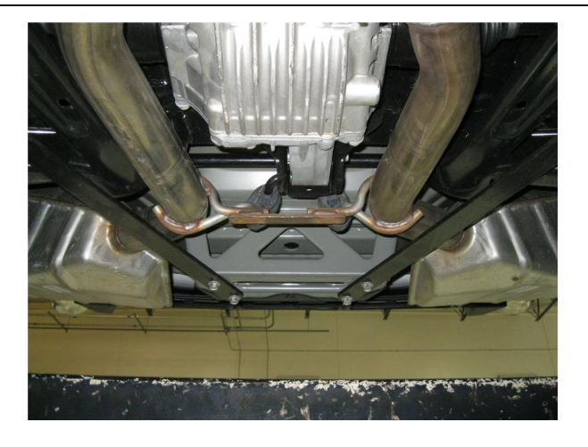
Step 1. Begin by removing the two rear chassis stiffeners by the muffler inlets. This will allow access to the exhaust system.