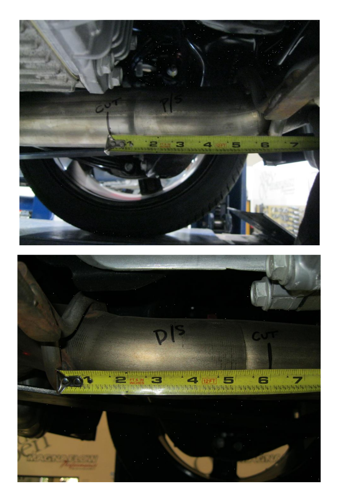
Step 2. You will need to cut the OEM exhaust system to remove it and install the new Magnaflow system. Measure and cut 6.00" forward of the hanger on the passenger side and driver side pipes. Remove mufflers and retain rubber hanger insulators to install the new system