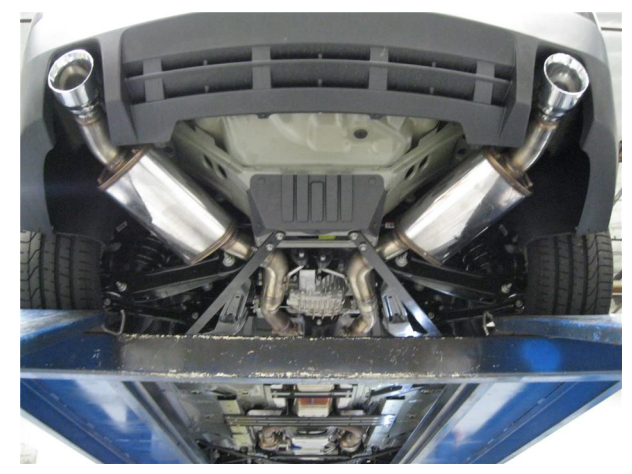
Step 3. Install the new system by attaching the Driver and Passenger Muffler Assemblies to the cut portion of the OEM system using the supplied 3.00" clamps. Leave clamps loose for final adjustment. Fit the hangers into the rubber insulators.