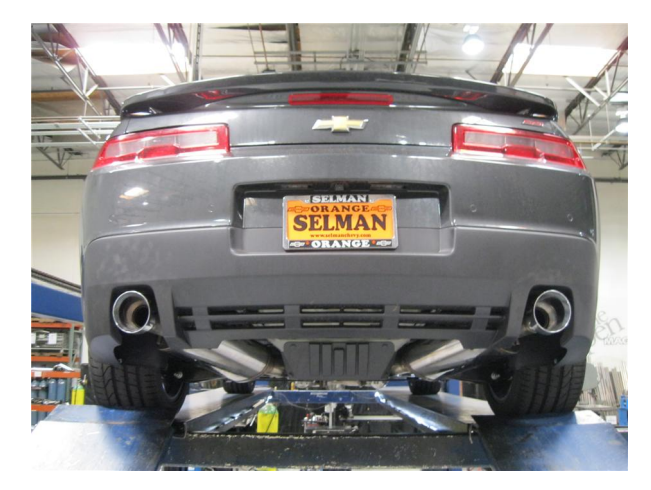
Step 4. Once a final position has been chosen for the new exhaust system, evenly tighten all clamps from front to rear using the torque specifications on page one of the instructions. Inspect all fasteners after 25-50 miles of operation and re-tighten if necessary.

MAGNAFLOW: 22961 Arroyo Vista - Rancho Santa Margarita, CA 92688 | 1(800) 990-0905 Technical Support: 1(800) 959-9226 | Email: moreinfo@magnaflow.com