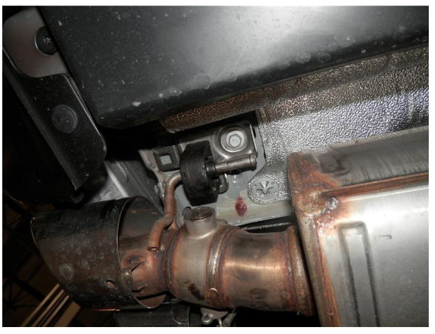
Step 2. Next, remove the tubular support brace connectiing the right and left exhaust, remove the right and left vacuum line from the exhaust valves (plug and zip tie out of the way, these will NOT be re-used), remove hangers from rubber insulators and drop the exhaust. Retain rubber insulators as they will be re-used on the new system.