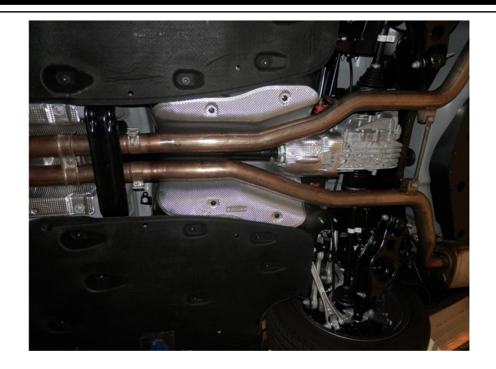
Step 1. Begin removal of the OEM exhaust system by loosening the two 3.00" clamps located behind the rear black cross brace.