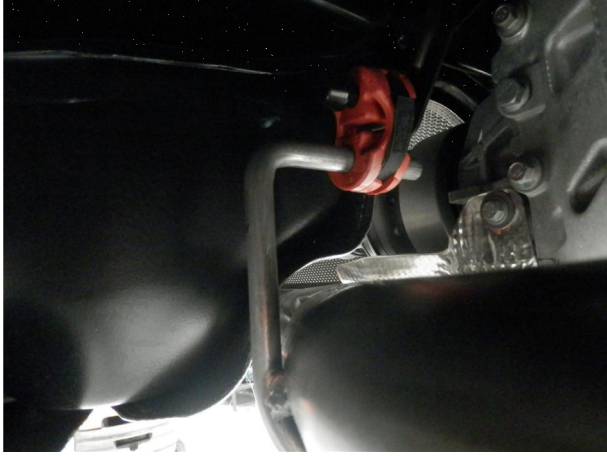
Step 3. Begin installation of the new system by attaching the Driver and Passenger side Inlet Pipe Assemblies to the OEM outlets using the Supplied 2.36" clamps. Fit the hangers into the rubber insulators. Leave all clamps loose until final assembly.