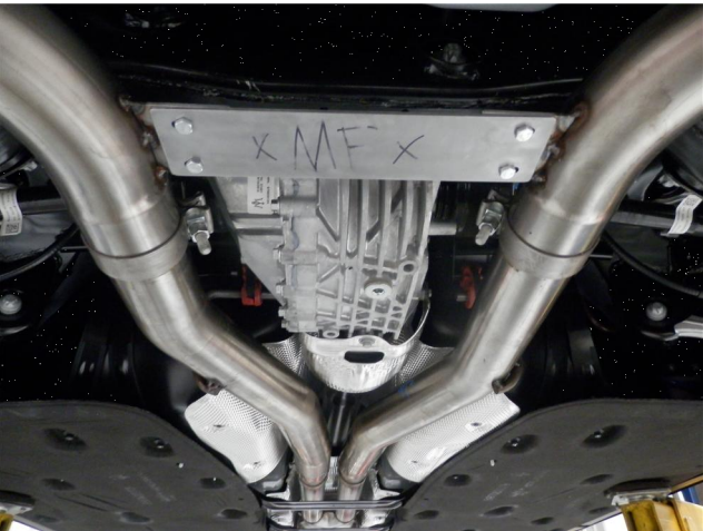
Step 4. Next, install the Driver and Passenger side muffler assemblies to the outlets of the Inlet assemblies using the supplied 3.00" clamps and fit the hangers into the rubber insualtors. Loosely Fit the Magnaflow cross brace using the supplied fasteners.