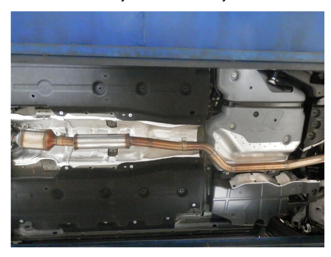
Step 3. Next attach the Mid-Pipe to the Resonator Assembly using a 2.50" clamp.