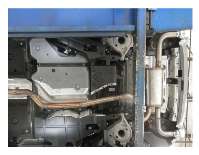
Step 4. Complete the installation by attaching the Muffler Assembly to the Mid-Pipe using a 2.50" clamp and fitting the hangers into the rubber insulators.