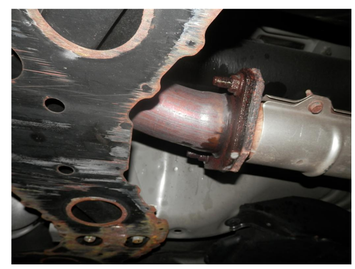
Step 1. Begin removal of the OEM exhaust system by unbolting the flanges attaching the exhaust to the catalytic converter. Do not discard or damage the OEM fasteners or rubber insulators as they will be used to install the new system.