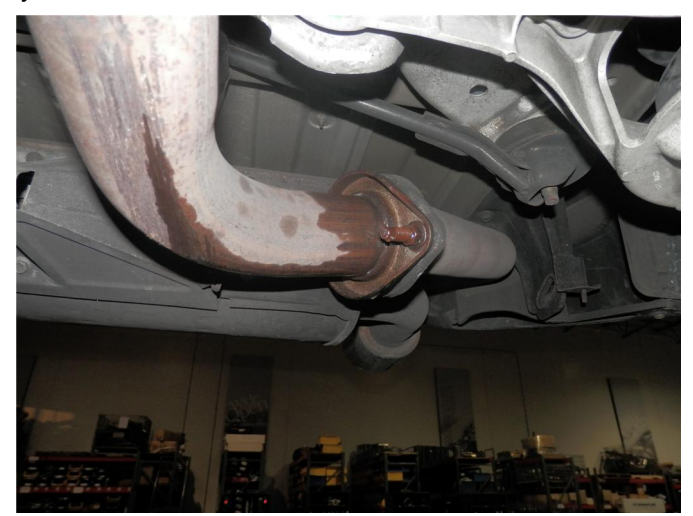
Step 2. Unbolt the flange junction between the mid pipe and the muffler assembly. Disengage hangers from rubber insulators and remove the OEM exhaust.