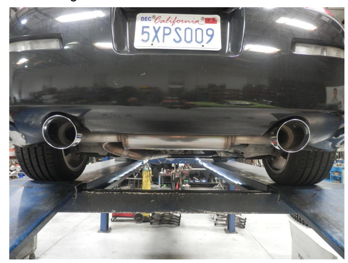
Step 6. Once a final position has been chosen for the new exhaust system, evenly tighten all clamps from front to rear using the torque specifications on page one of the instructions. Inspect all fasteners after 25-50 miles of operation and re-tighten if necessary.