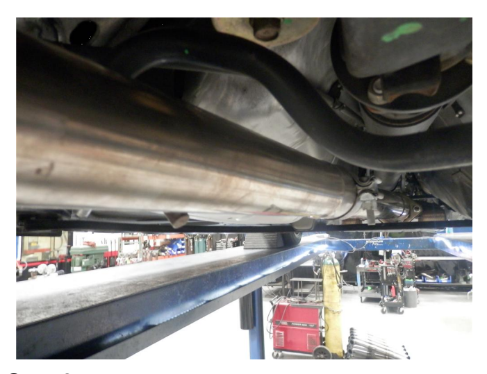
Step 3. Begin installation of your new MAGNAFLOW system by attaching the flanges of the Inlet Pipe Assembly to the catalytic converter outlet using the OEM hardware. Keep all fasteners and clamps loose until final adjustment.