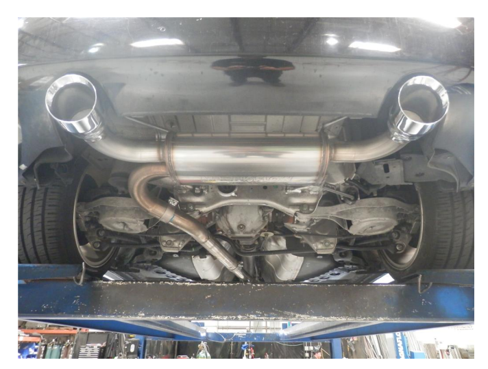
Step 5. Loosely attach the Muffler Assembly to the Mid Pipe Assembly using the supplied clamp. Engage all welded hangers to the rubber insulators.