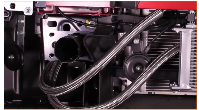
28. Fully tighten both oil line fittings onto the oil cooler.

29. Check to make sure all oil line fittings and mounting bolts are tight. Check the routing of the oil lines to ensure that they will not contact suspension components during driving.