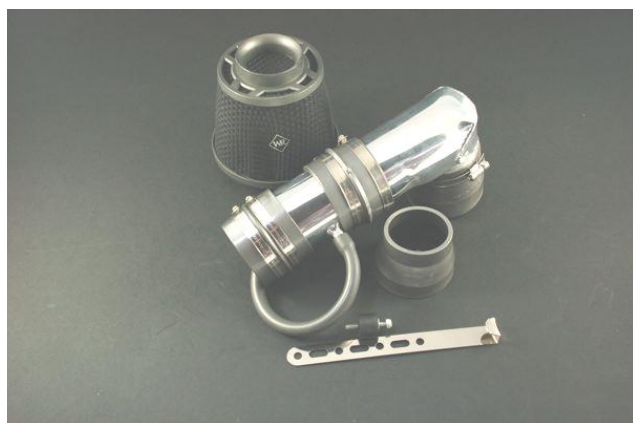
2003 Dodge Stratus 2.7L V6 SW intake kit as shown.

Installation does require some mechanical skills. We recommend a qualified mechanic to install this product.